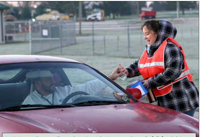
A LEAD employee collects donations during Letterkenny's fall food drive as employees pulled through the gate before shifts began. Employees collected $850.52 that went toward needy families in the area.

The program, which is sponsored by the Special Emphasis Committee, is an annual event and one that continues to grow each year.