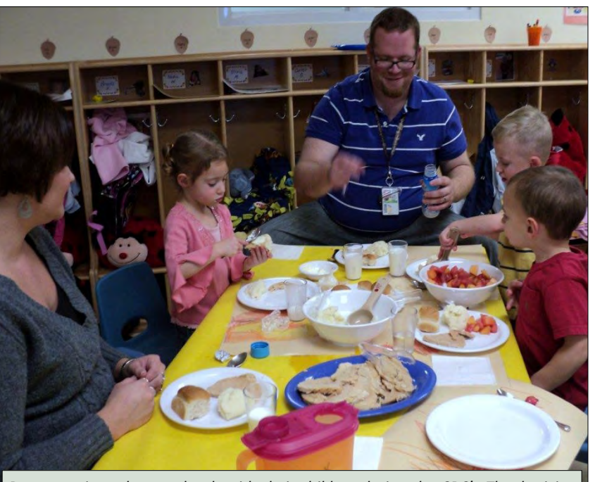
Parents enjoy a harvest lunch with their children during the CDC's Thanksgiving celebration. During the month of November, CDC children learned about families and their roles as an introduction to the upcoming holiday season.

and parents participated in a holiday cuddle during Christmas story time.