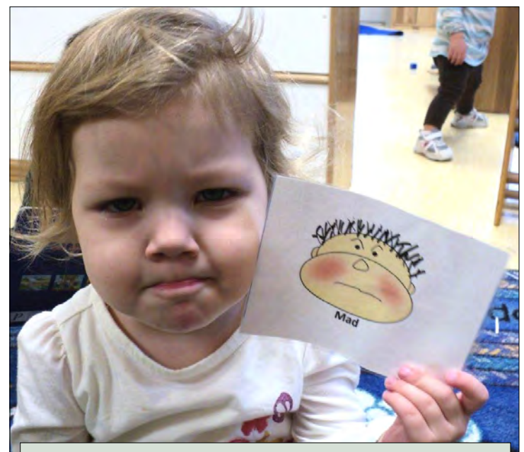
Toddlers at the CDC learn to express emotion in positive ways. Above, a CDC toddler demonstrates an emotion with a flashcard.

The CDC had several Christmas events for children and their families in December. The Fannett-Metal Senior High School choir stopped at the CDC during its Depot tour and sang Christmas carols to the children. Santa visited the CDC, children made a Christmas craft,