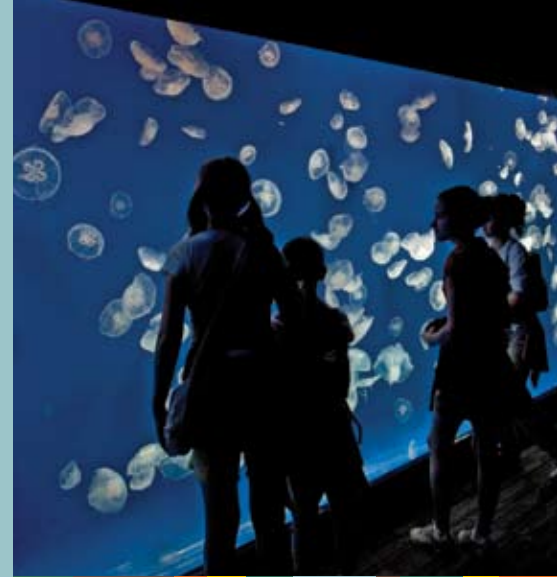
Left: The aquarium's eco-tour boat, the River Gorge Explorer, in front of one of the aquarium buildings. Middle: An aquarium staff member shows a shark jaw to Tennessee Aquarium summer campers. Right: The aquarium's Jellies: Living Art gallery

on hard times and was a shell of its former vibrant self. Since then, the aquarium has established itself as a leader in its community, helping to revitalize its city and demonstrating a sustainable, long-term contribution to the ecological well-being of the community and the education of those who live in the region.