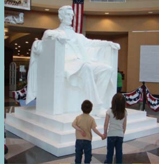
Left: A young visitor asks a question during a live conversation with Clay Anderson, an astronaut aboard the International Space Station; photo courtesy of the Courier News. Middle: Installation of the GIANTS: African Dinosaurs exhibit. Right: Young visitors view an exhibit on display as part of the Tapestry of Freedom program.