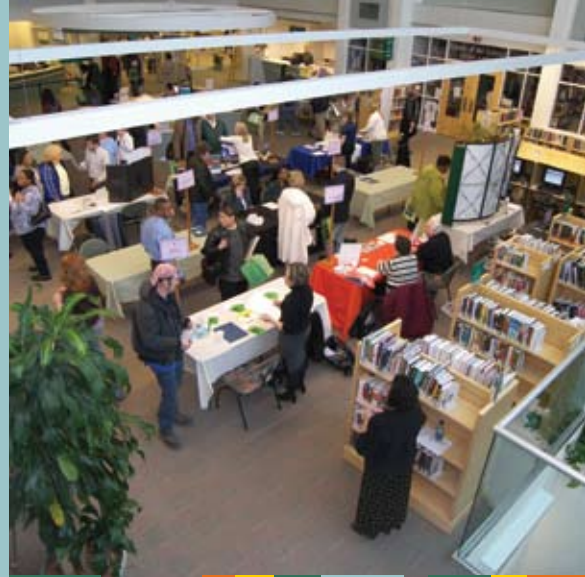
Left: Adults enhance their job skills at the library's free computer classes. Middle: Kids' early literacy skills improve when they read to their canine friends through the library's Pups & Pages programs. Right: At the annual Opportunities Job Fair, job seekers and employers meet face-to-face, hoping to make the perfect match.

gramming it has spurred—is a promise that the library will remain a constant in Stark County, there to help the community recover and ultimately flourish.