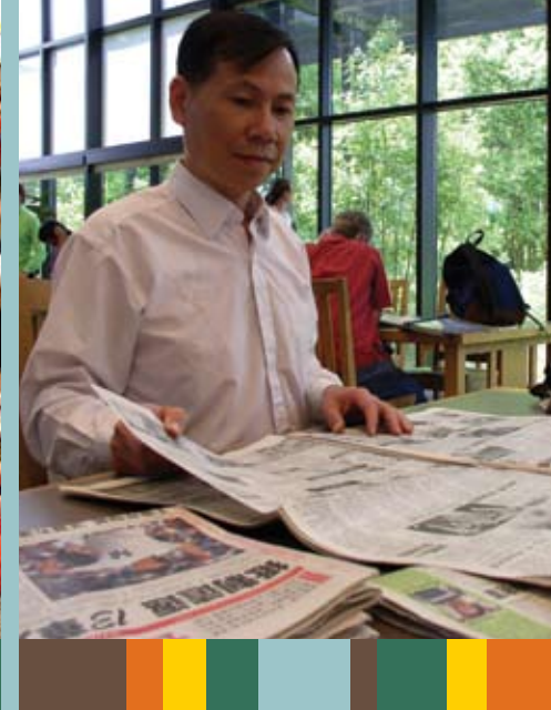
Left: The Central Library is located in downtown Portland and is on the National Register of Historic Places. Middle: Spanish language storytime is a popular Multnomah County Library program, photo by Kristin Beadle. Right: The library's collection features newspapers in various languages, photo by Kristin Beadle.