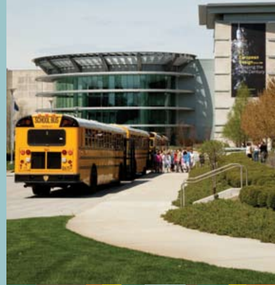
Left: Students lean in for a closer look at a glass piece in the galleries. Middle: Visitors check out the museum's online offerings in The Davis LAB, equipped with four computer stations. Right: Buses drop off and pick up students at the Efrogmson Family Entrance Pavilion.