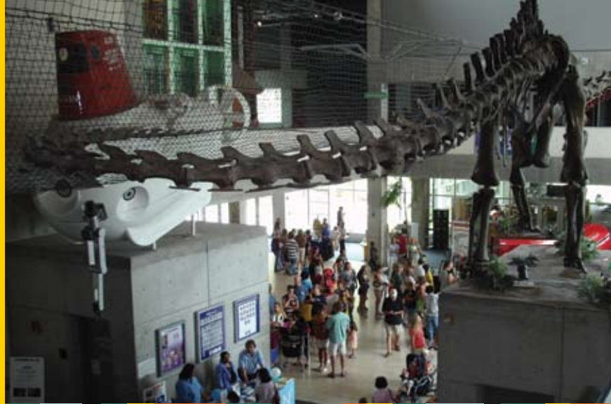
Left: MOSI offers a wide array of enrichment programs and classes for students. Right: Inside the MOSI entryway.