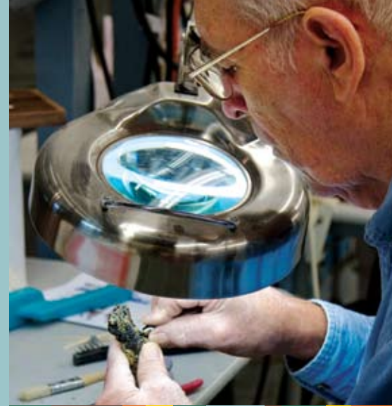
Left: The Center welcomes more than 2,000 people for a viewing of the 2009 presidential inauguration. Middle: Hands-on activities during the annual Passport to the World series of culture festivals, Right: A volunteer in the Center's "Paleo Lab" engages in active research

interaction and learning; a place where exhibits and programs converge for the enjoyment and education of its millions of visitors each year.