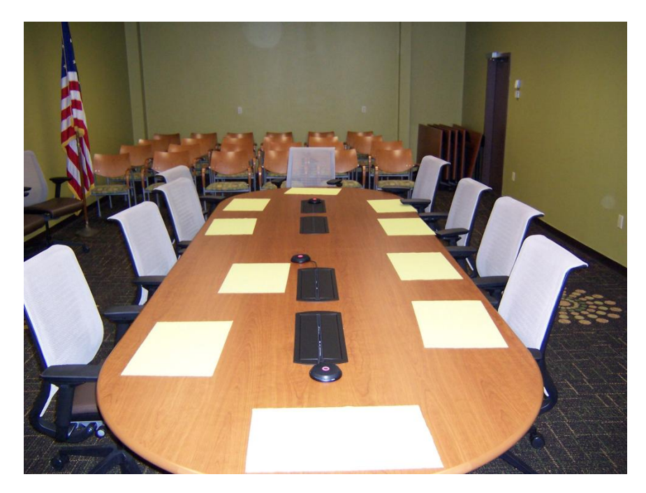
Above is another picture of the furniture purchased for the Authority's boardroom using Recovery Act funds.

Authority officials used Recovery Act funds to purchase furniture and equipment for use in their boardroom located at the administrative office. The picture above shows items purchased with the funding, including an interactive whiteboard, wall-mounted projector, and furniture.