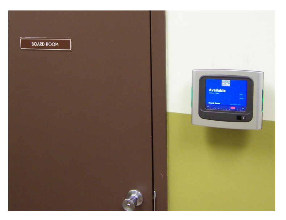
Above is a picture of the Web-based scheduling system outside the Authority's boardroom, which was purchased using Recovery Act funds.