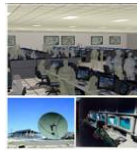
Air Force Distributed Common Ground System (AF DCGS)

There are no compatibility issues between ANG and AC DCGS; however, there are compatibility issues between DCGS, Predator SOC, and theater units. Crew voice communications between the two weapon systems is required to maintain situational awareness during mission operations. Delivery of the crew communications suite to all ANG DGS sites will permit crew voice communications between the Distributed Ground Station (DGS) sites only, but not to the SOC.