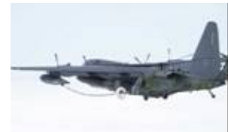
HC/MC-130 Combat Rescue Aircraft

Currently, there are no equipment compatibility issues between the active force and the ANG HC/MC130s. The ANG began a NGREA-funded program for its nine HC-130s and four MC-130s which upgrades its existing personnel locator system to the AN/ARS-6 LARS V12 capability. The Air Force is funding a communications and data link upgrade for all ANG HC/MC-130 aircraft; contract award is expected in FY 2011. Expected modernization shortfalls for the upcoming FY and through FY 2013 include crashworthy loadmaster seats for all ANG aircraft and dual rail cargo handling capability for a portion of the ANG aircraft.