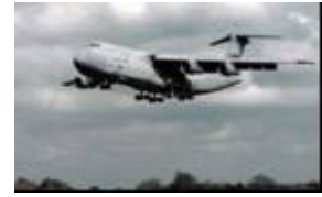
C-5A Strategic Airlift Aircraft

AC and AFR C-5B/M aircraft are modified with aircraft defensive systems (ADS) which permit operations in hostile environments. ADS for ANG aircraft was funded and is awaiting installation with anticipated completion in FY 2014. Without ADS, ANG C-5A aircraft were not permitted to enter certain airfields in the CENTCOM area of operations. Additionally, the lack of ADS decreases aircraft available to meet certain mission taskings, and increases the threat of undetected MANPADS launches. Due to funding constraints, the ANG C-5A fleet will have the following modernization shortfalls: 1) Stress corrosion cracking on the aft crown skin limits the cargo load factor to 80 percent and will be adjusted according to severity of the cracking. Total C-5A fleet cost to replace the aft skin is estimated at $297M. 2) Advanced IR countermeasure (IRCM) self-protective suite for $320.7M: Aircraft must be modified with ADS before any modification for the more advanced and effective LAIRCM can go forward.