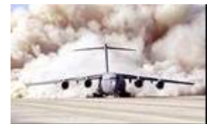
C-17 Strategic Airlift Aircraft

Installation of LAIRCM is still top priority. All eight ANG C-17 aircraft are funded by the FY 2009 and FY 2010 supplemental appropriations to receive LAIRCM upgrades. Currently, the LAIRCM contract is under renegotiation and the production line should resume in early FY 2011.