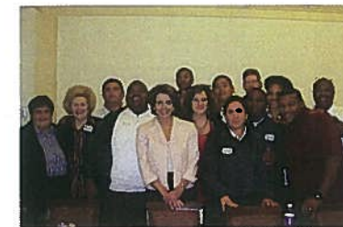
REPRESENTATIVE PELOSI DISCUSSES THE CONGRESSIONAL AGENDA WITH TREASURE ISLAND’S LIFE LEARNING ACADEMY.