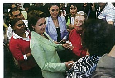
REPRESENTATIVE PELOSI CONGRATULATES PARTICIPANTS AT HER ANNUAL CITIZENSHIP WORKSHOP IN SAN FRANCISCO ON COMPLETING APPLICATIONS.

The New Direction Congress passed the first increase in the minimum wage in 10 years as part of the broader goal of growing our economy and providing greater opportunity for all Americans. When the law takes full effect, the annual pay for a minimum-wage worker will increase by $4,400 per year. The benefits of the pay raise will be felt by more than 13 million American workers, in addition to more than 6 million children of low-wage workers.