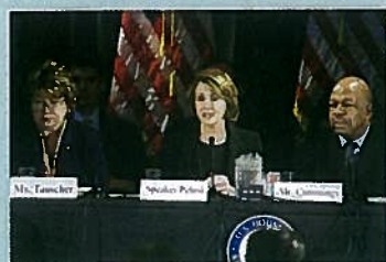
REPRESENTATIVE PELOSI, REPRESENTATIVE ELLEN TAUSCHER AND REPRESENTATIVE ELIJAH CUMMINGS QUESTION PANELISTS AT A FIELD HEARING ON THE SAN FRANCISCO BAY OIL SPILL.

I have asked the Inspector General of the Department of Homeland Security to begin an investigation of the Coast Guard response to this spill so we can understand what happened and be better prepared for another environmental disaster. The Coast Guard must be held accountable for any delays in responding to the spill and delays in reporting the severity of the spill to local officials. The people of the Bay Area should have confidence that the responsible parties will be held accountable for their actions and that mistakes made in response to disasters of this kind will not happen again.