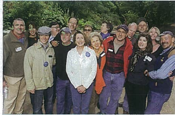
REPRESENTATIVE PELOSI SPEAKS TO PARTICIPANTS AT THE NATIONAL AIDS MEMORIAL GROVE WORKDAY ABOUT PROGRESS MADE IN THE FIGHT AGAINST AIDS.