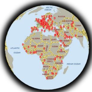
TRICARE PRIME REMOTE SITES

To enroll in TRICARE Prime Overseas, submit a TRICARE Prime Enrollment Application and PCM Change Form along with a copy of your orders to your regional call center or TRICARE Service Center .