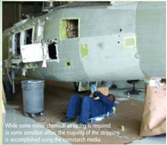
While some minor chemical stripping is required in some sensitive areas, the majority of the stripping is accomplished using the cornstarch media.