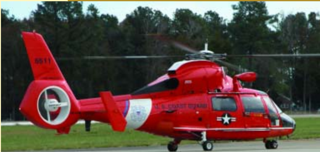
With its overhaul complete, this U.S. Coast Guard HH-65B Dauphin helicopter is heading out to a field unit.

The U.S. Coast Guard HH-65B Short Range Recovery (SRR) helicopter, a product of the Aerospatiale Helicopter Corporation, is designed for short-range search and rescue operations, patrol and observation, passenger transport, and cargo hook operations. The HH-65 Product Line Division at ARSC is responsible for performing depot level overhaul maintenance, technical support to the field units, and well as numerous aircraft upgrade projects. On average, 23 aircraft per year complete their 48-month overhaul cycle. During these overhauls, aircraft receive numerous avionics and airframe upgrades. Recently, ARCS began an aircraft re-engine project where all HH-65 aircraft will be retrofitted with new Turbomecca engines.