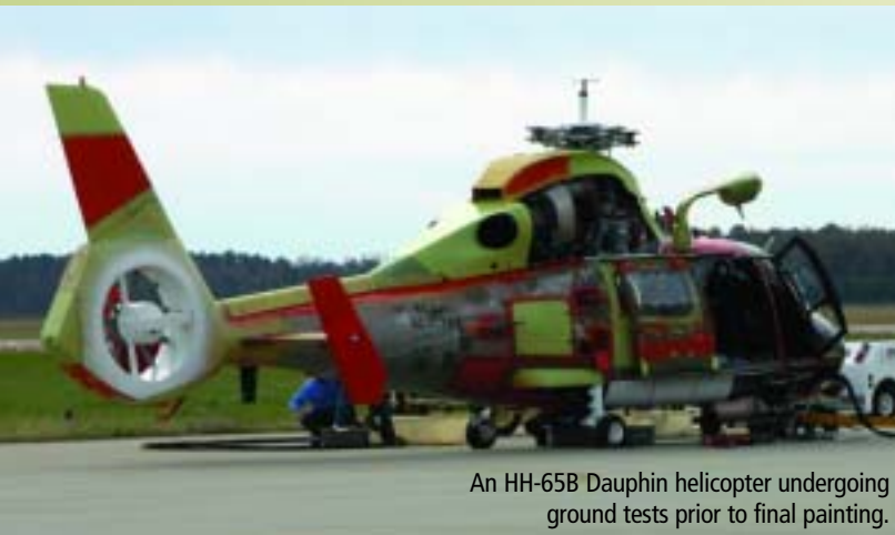
An HH-65B Dauphin helicopter undergoing ground tests prior to final painting.

floorboards had to be found that would not damage the product, and would be friendly to both the environment and the people using it.