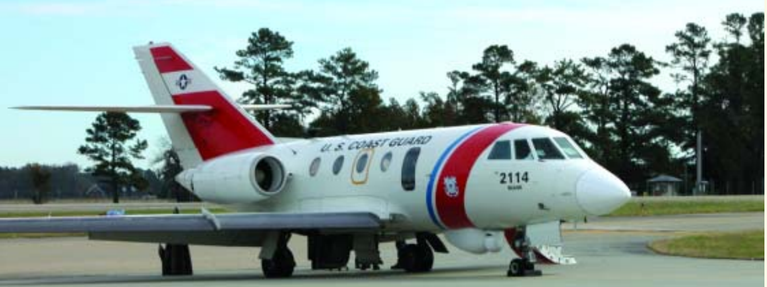
An HU25C Falcon undergoing final checkouts prior to field unit delivery.