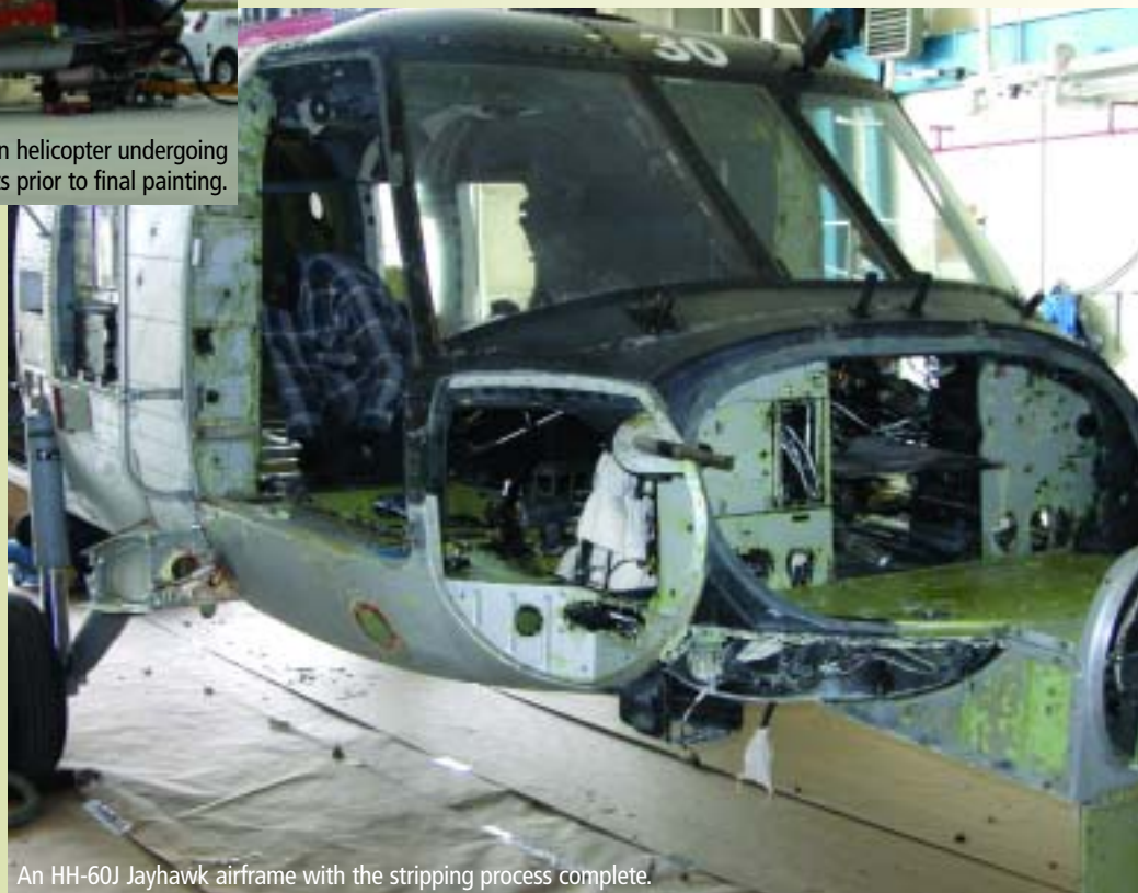
An HH-60J Jayhawk airframe with the stripping process complete.

(NOTE: HH-65 Product Line Technical Services is part of the HH-65 Product Line Division. In the Coast Guard, a Product Line is a division where the aircraft maintenance, overhaul, and day-to-day technical/engineering services are provided to the field. ARSC serves as the warehouse where aircraft parts are stored and shipped out to the field as the need arises. Each product line is its own entity, driven by the needs of the field units and the Coast Guard in general.)