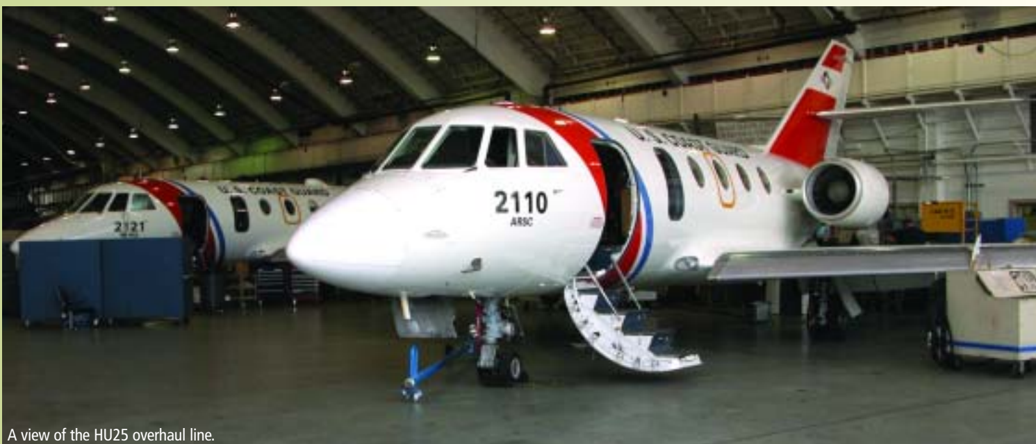
A view of the HU25 overhaul line.