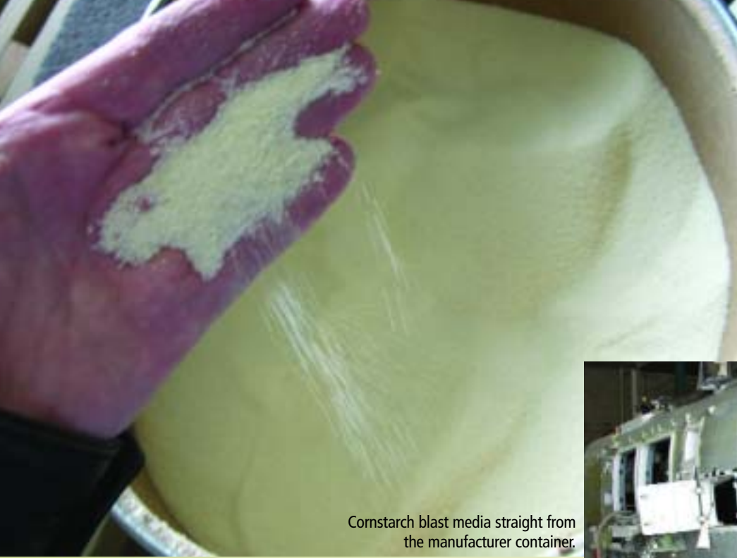
Cornstarch blast media straight from the manufacturer container.