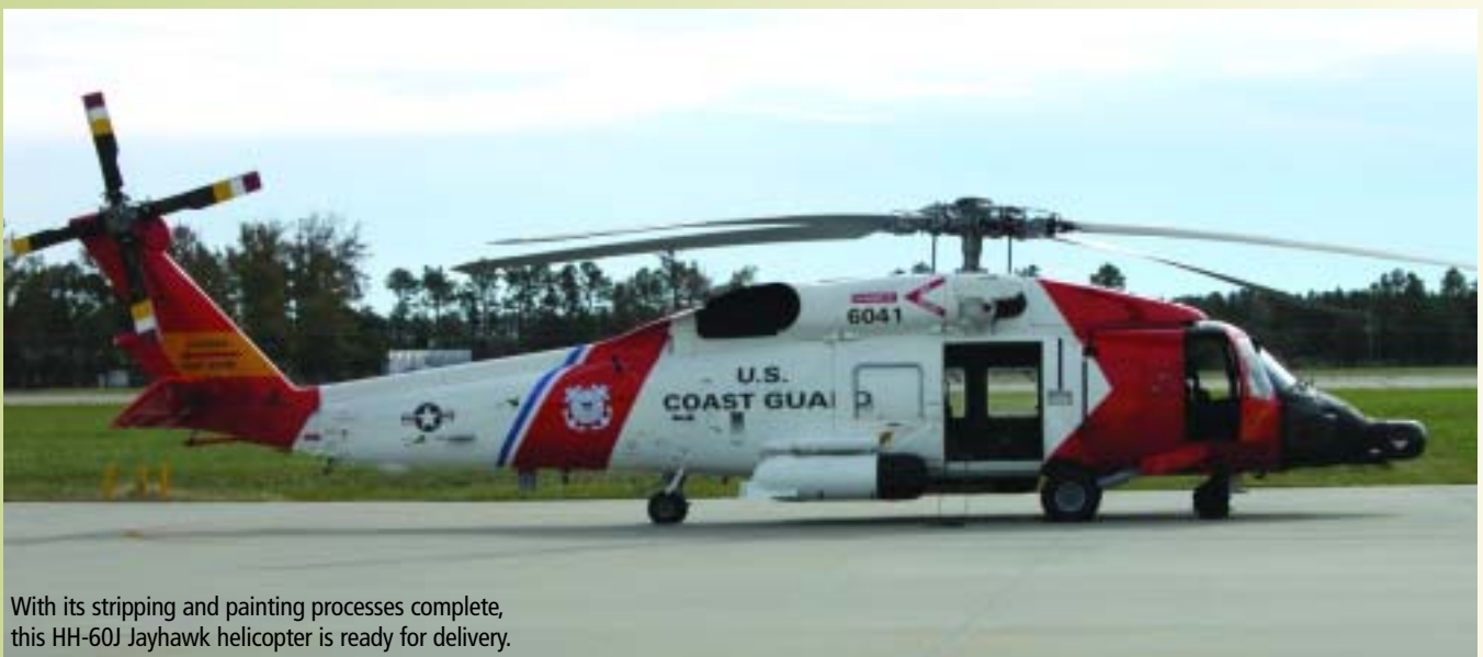
With its stripping and painting processes complete, this HH-60J Jayhawk helicopter is ready for delivery.