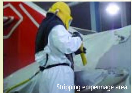
Stripping empennage area.