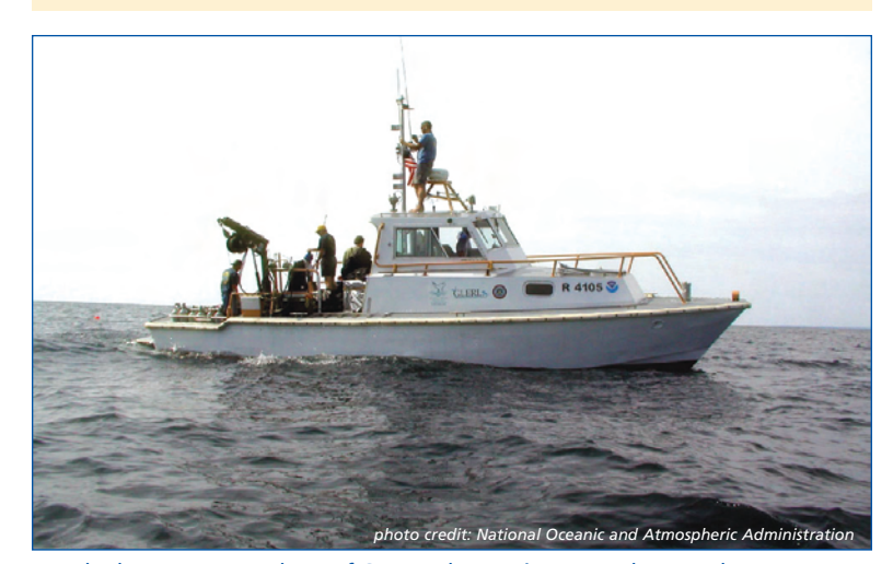
For the last two years, three of Great Lakes Environmental Research Laboratory's diesel ships run completely on biobased (rather than petroleum-based) products. Their efforts have garnered honors from the U.S. Department of Energy Federal Energy Management Program.

GLERL also uses Hydro Safe ISO VG 68, which is made by Hydro Safe of Dewitt, Michigan.