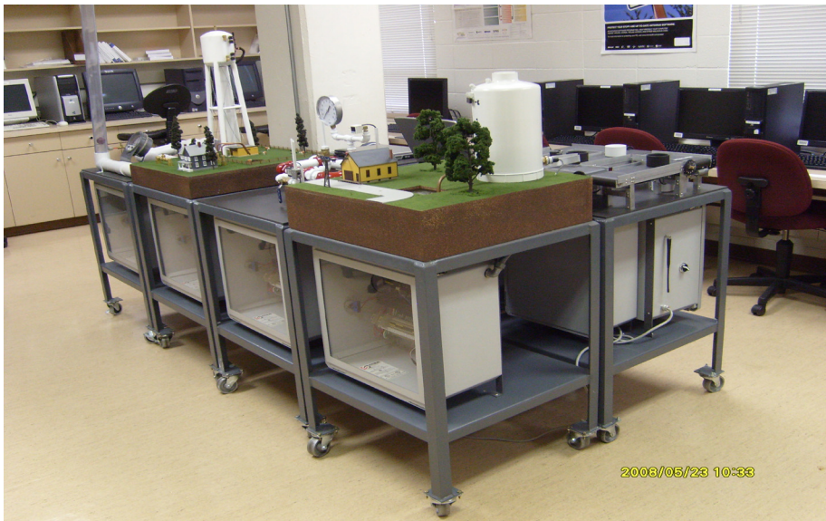
Figure 2. Critical Infrastructure Protection Center SCADA Lab

managed or maintained by IT staff in industrial settings. Such systems are pervasive in what is today referred to as our national critical infrastructure as defined by the U.S. government under Homeland Security Presidential Directive-7 8 . While much of this software is