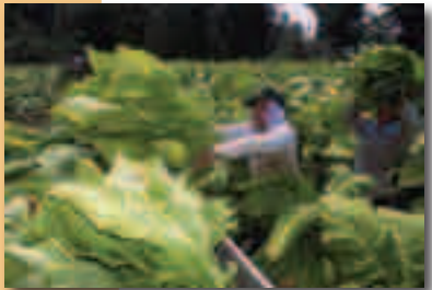
Anyone who works where there are infected mosquitoes is at risk of WNV infection.

groundskeepers and gardeners, painters, roofers, pavers, construction workers, laborers, mechanics, and other outdoor workers. Entomologists and other field workers are also at risk while conducting surveillance and other research outdoors. All outdoor workers should follow the recommendations in this brochure to reduce their potential for WNV exposure.