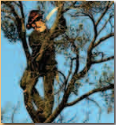
Outdoor workers are at risk of WNV infection.