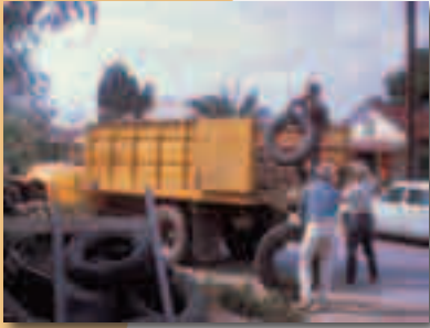
Removing tires from worksites helps to reduce mosquito populations.