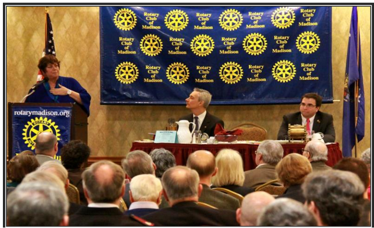
Addressing the Rotary Club of Madison

Going next to Madison, Wisconsin, I spoke to the Madison Rotary Club on February 15, followed by the International Women's Forum on the 16<sup>th</sup>, and East High School on February 20.