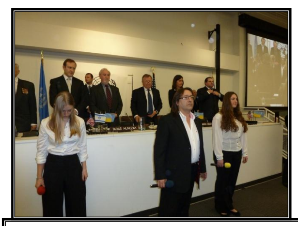
Babi Yar Commemoration at the United Nations

I travelled to New York City on January 25 to participate in a commemoration of the Babi Yar massacre in Ukraine, sponsored by the Missions of Ukraine and of Israel to the United Nations. Following that, I attended a screening of "The Last Flight of Petr Ginz," produced by the Documentary Film Center at Wake Forest University. It is about a 14-year-old artistic Czech boy who perished in Auschwitz at the age of 16. The UN created a study guide to accompany the film in all six official UN languages, plus Czech and Hebrew.