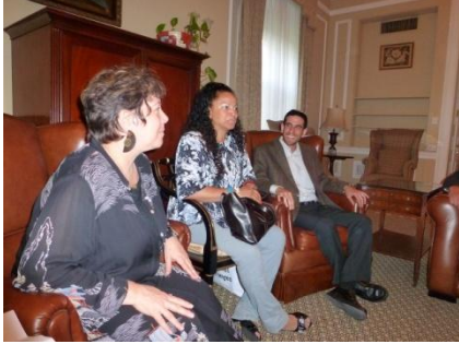
At the interfaith gathering