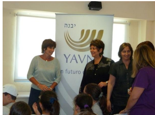
At the Yavne School

The Comité Central Israelita del Uruguay (in English, the Central Jewish Committee of Uruguay) represents local community organizations in Montevideo and the rural provinces of Paysandu and Maldonado. At our meeting, we discussed the issues of adapting the public education curriculum to incorporate lessons on the Holocaust and anti-Semitism and improving the efficiency of the Honorary Commission to Combat Racism, Xenophobia and all Forms of Discrimination.