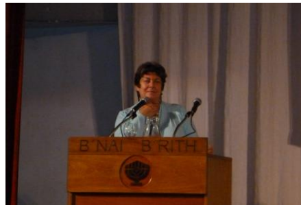
Addressing the B'nai B'rith Conference