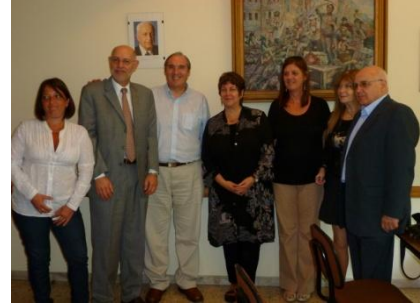
With leaders of the Comite Central Israelita del Uruguay