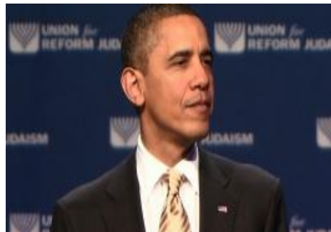
President Obama addressing the URJ

On Friday, December 16 President Obama delivered a speech at the 71st General Assembly of the Union for Reform Judaism. Click here to watch the video of the President's remarks and here to read the transcript or copy and paste the Internet address into your browser: http://www.whitehouse.gov/photos-and-video/video/2011/12/16/president-obama-speaks-71st-general-assembly-union-reform-judaism .