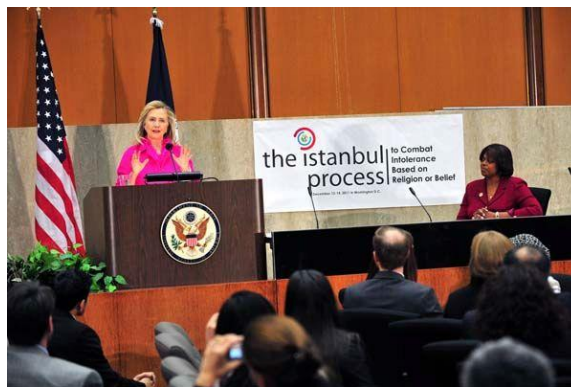
Secretary Clinton closes the conference

http://www.state.gov/secretary/rm/2011/12/178866.htm