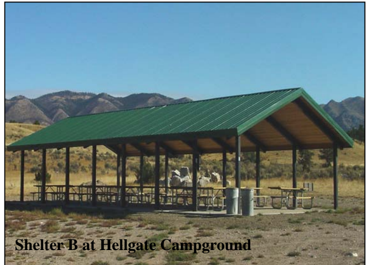
Shelter B at Hellgate Campground