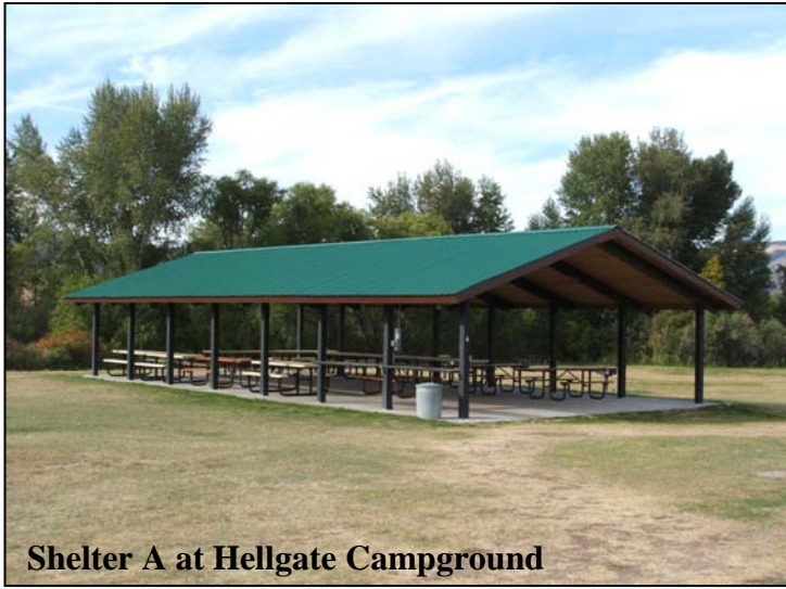
Shelter A at Hellgate Campground