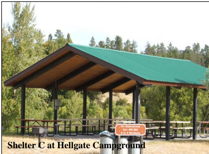
Shelter C at Hellgate Campground