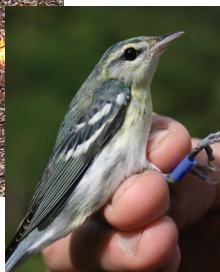
Cerulean warbler.