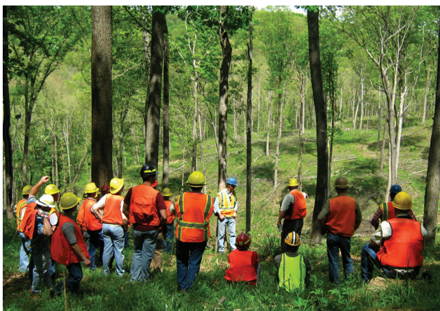
Tour of area with five prescribed fires, an herbicide application, and a shelterwood harvest.

Though research on the VFSEF was initiated in cooperation with forest industry, it has been used by forestry practitioners, researchers, students, landowners, policy makers and the public. Research results are communicated through forest tours, demonstration areas, presentations, and publications. Visitors from as far away as China regularly travel to the VFSEF to see side-by-side comparisons of outcomes of management alternatives. More than 200 scientific publications have been produced so far, and much of the Forest Service's data and publications are electronically available to researchers and students.