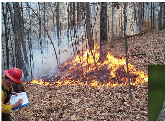
Documenting prescribed fire behavior.