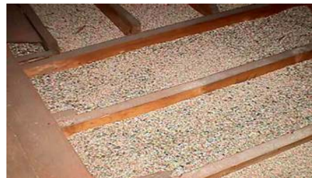
Vermiculite insulation between attic joists