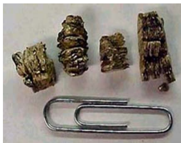
Vermiculite insulation particle size relative to paper clip