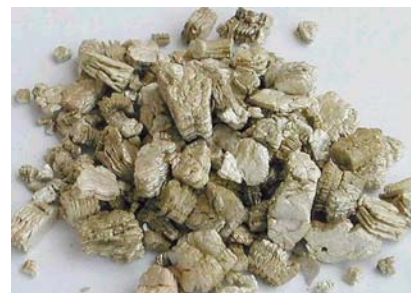
Typical vermiculite insulation