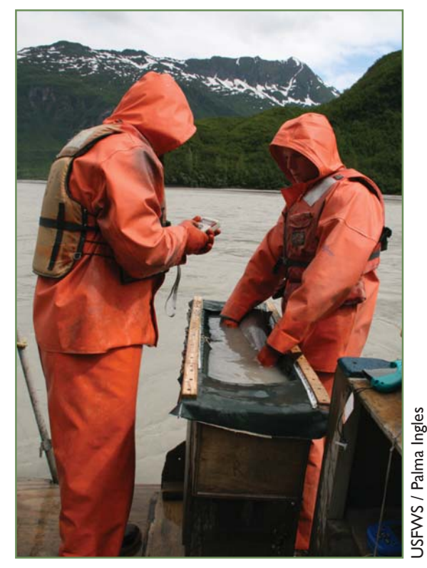
Native Village of Eyak technicians tagging Chinook salmon on the Copper River to estimate numbers of Chinook salmon returning to spawn.