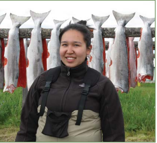
JSFWS / Palma Ins