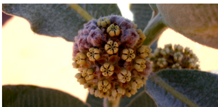
Welsh's milkweed flowers

Welsh's milkweed differs from broadleaf milkweed ( A. latifolia ) by its larger seeds (1+ inches long), spreading to downward