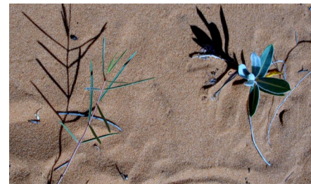
Juvenile forms

The Utah Field Office's website contains species leads and important information regarding federally listed species in the state, including a copy of this fact sheet: www.fws.gov/utahfieldoffice