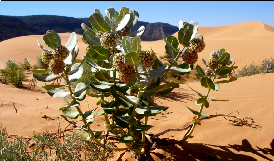
Welsh's milkweed in habitat

threatened on October 28, 1987 (52 FR 41435). Critical habitat for this species includes about 4,000 acres of sand dune habitat in the Coral Pink Sand Dunes State Park and the Sand Hills area in Kane County, Utah.