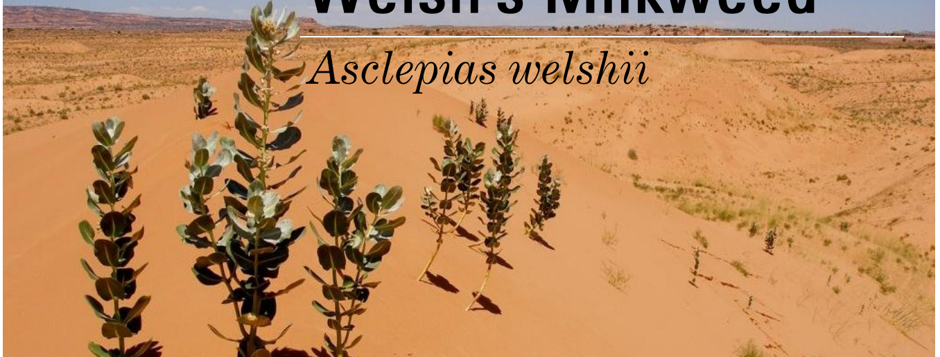
Welsh's milkweed