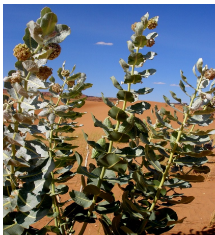
Daniela Roth / NNHP

To learn more about the Welsh's milkweed and conservation efforts on behalf of the species, please visit the following sites: