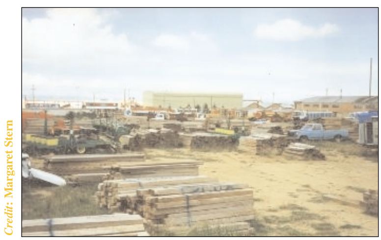
Impounded mahogany timber deposited with the National Forestry Superintendence (SIF) of Bolivia