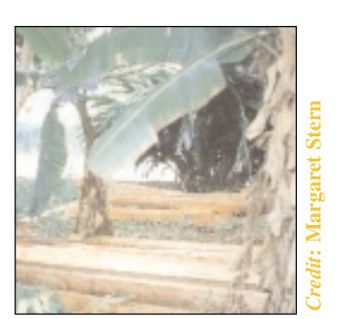
Illegally produced mahogany planks in Puerto Villarroel, Bolivia