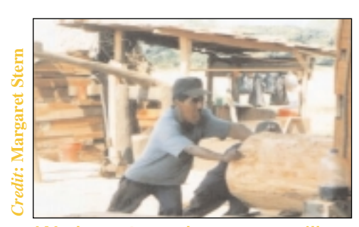
Workers at a mahogany sawmill

The full impact of the CITES Appendix III listing itself is difficult to assess, as changes to legislative structures and control mechanisms governing the harvest and trade of S. macrophylla reflect a response to a combination of factors, of which the listing is just one. These include local and