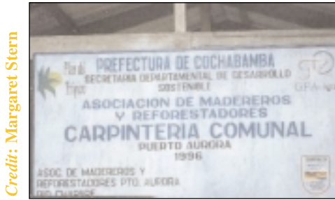
Sign outside an unofficial carpenter's workshop in Puerto Aurora, Bolivia

In keeping with the conditions of the Single Market, reexports of S. macrophylla within the EU are not controlled or monitored, and there is no documentary evidence of this trade. Traders seeking to re-export timber to a country outside the EU must first acquire a CITES re-export certificate and such certificates are only issued following confirmation that the specimens to be re-exported were legally imported into