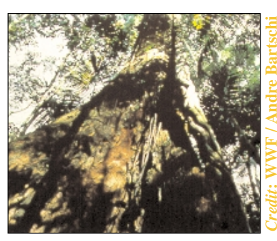
Live mahogany tree

Upon receipt of an application, the CITES Co-ordinator forwards it, together with a report to the CITES Scientific Authority, which reviews the information and returns the applications with a new report and the decision on the application within 24 hours, unless additional information is needed. Upon completion of the