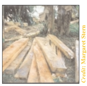
Mahogany planks "camouflaged" among banana plants

Costa Rica was the first country to include Swietenia macrophylla in CITES Appendix III. S. macrophylla harvests were banned by the Ministry of the Environment and Energy (MINAE) in January 1997 under Decree No. 25700 . No CITES export permits have been issued since that time (Y. Matamorros, Council of Costa Rica