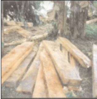
Mahogany planks "camouflaged" among banana plants