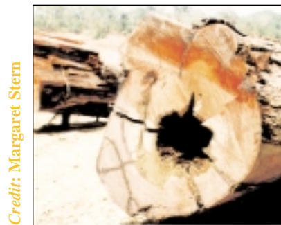
A hewn log of mahogany

Increased harvest and trade controls within Brazil have influenced overall S. macrophylla trade trends, and, as noted above, appear to have increased demand for this species from Peru. It will be important to analyse how internal consumption within Brazil and exports from Brazil of more fully processed products with higher added value have been affected, neither of which are regulated under CITES Appendix III.