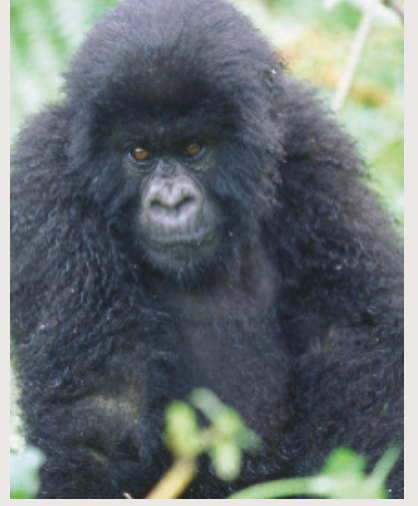
Above: Juvenile Mountain Gorilla

Left: Guns confiscated from commercial bushmeat hunters