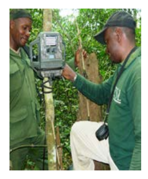
Training in Northern Virungas

Innovative capacity building approaches are needed to address complex conservation challenges in Africa. The USFWS developed its Signature Initiative, the MENTOR Fellowship Program (Mentoring for ENvironmental Training in Outreach and Resource conservation), to build multidisciplinary teams of emerging African conservation leaders who work collaboratively on conservationdevelopment-community partnerships.