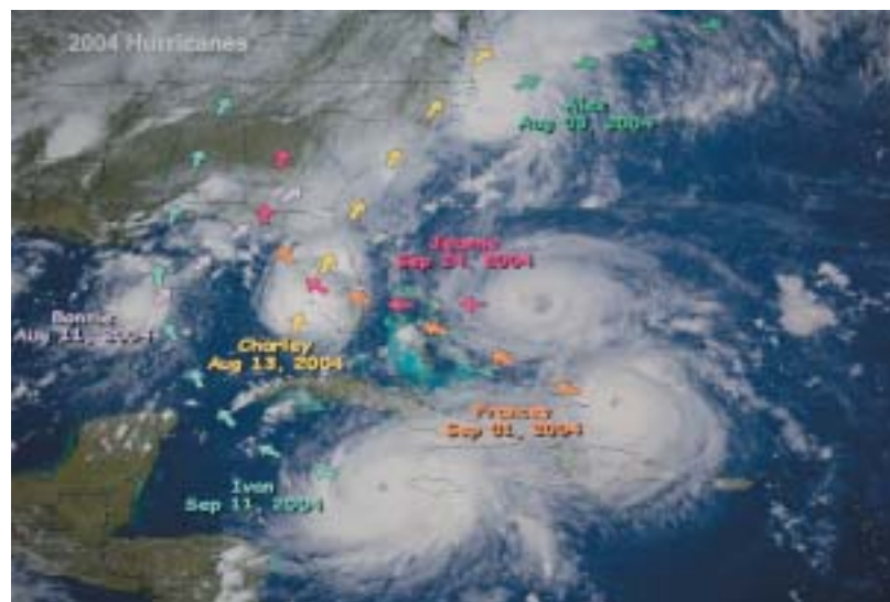
2004 Hurricane Season, The University of Wisconsin-Madison, Space Science and Engineering Center, November 30, 2004

To reduce the impact of ice storms, continuous and useful information about the hazard must be made available to everyone affected. Geographic information systems can be used to provide integrated weather information and road conditions. Identifying the effects of wind on ice-laden structures and trees, of low visibilities in blowing snow, and the impact on just-in-time transportation systems can inform mitigation efforts and reduce disruption.