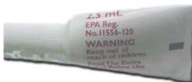
Advantage product tube