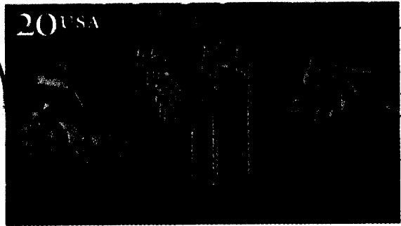
The City College of New York * CUNY * 150TH ANNIVERSARY

Mailed in USA Policy Comment Office of Sec., Federal Trade Commission Room 159, Sixth & Penn. Ave. N.W. Washington, DC 20580