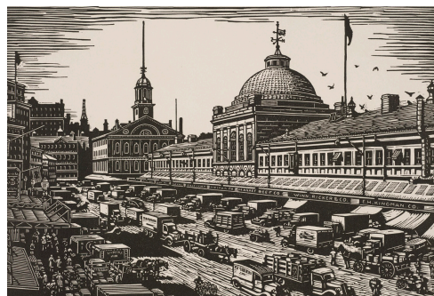
Image of Faneuil Hall and Quincy Market