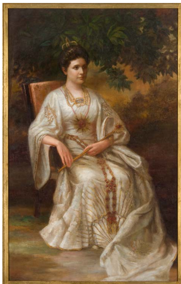
Figure 8a,b: During and After treatment of 1898 Winnie Davis portrait that was recovered from the Hurricane Katrina disaster and treated by University of Delaware and Winterthur Museum art conservation graduates and undergraduates