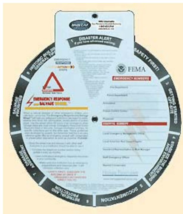
Figure 4: Emergency Response and Salvage Wheel

Perhaps one of the best outcomes that emerged from the Task Force's work is the creation of practical educational tools, including the Emergency Response and Salvage Wheel [Fig.4] and the Field Guide to Emergency Response .