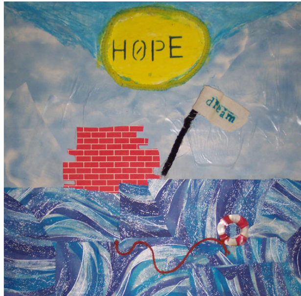
Figure 9: Collage by 5 th grader, Jake Wollfarth of New Orleans, following the Hurricane Katrina disaster

Many thanks to the collaborative efforts of disaster responders who strive to preserve our cultural heritage, some of which include Heritage Preservation (and especially Jane