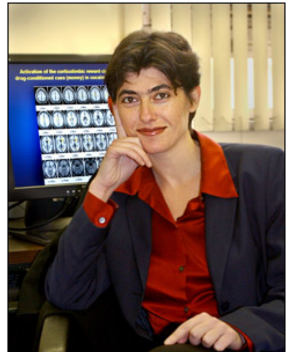
Rita Goldstein (click image to download hi-res version)

Goldstein's experiments were designed to test a theoretical model, called the Impaired Response Inhibition and Salience Attribution (I-RISA) model, which postulates that drug-addicted individuals disproportionately attribute salience, or value, to their drug of choice at the expense of other potentially but no-longer-rewarding stimuli — with a concomitant decrease in the ability to inhibit maladaptive drug use. In the experiments, the scientists subjected cocaine-addicted and non-drug-addicted individuals to a range of tests of behavior, cognition/thought, and emotion, while simultaneously monitoring their brain activity using functional magnetic resonance imaging (fMRI) and/or recordings of event-related potentials (ERP).