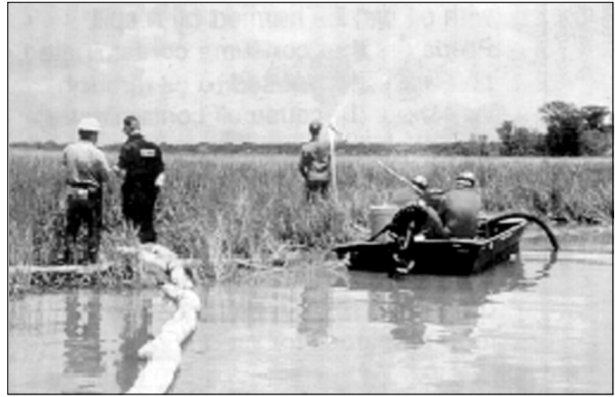
Crews work to keep oil from entering a marsh.