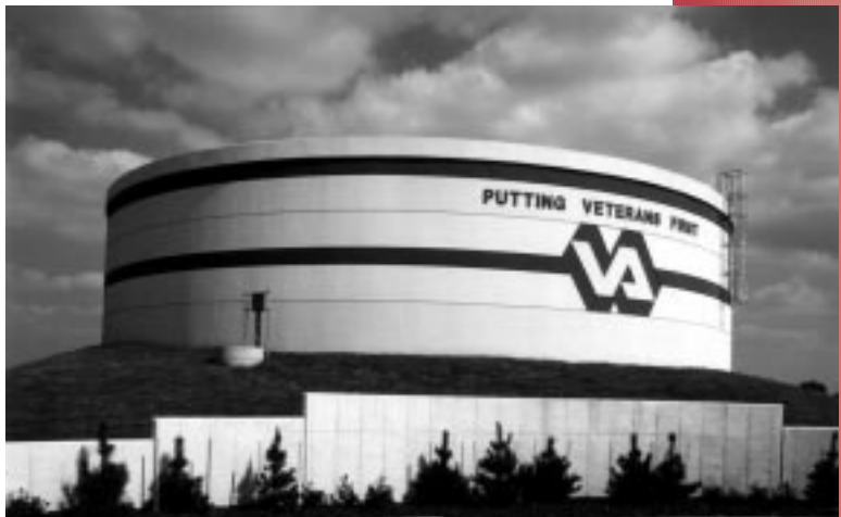
The VA Medical Center relies on this stratified water thermal storage system, with a 3.3-million-gallon-tank, to balance energy demands during peak needs.

The storage tank is filled with chilled water every night. Then every day, from noon until 8:00 p.m., the hospital draws its chilled water from the tank to meet its cooling load, instead of requiring continuous electric service to operate on-site chillers.