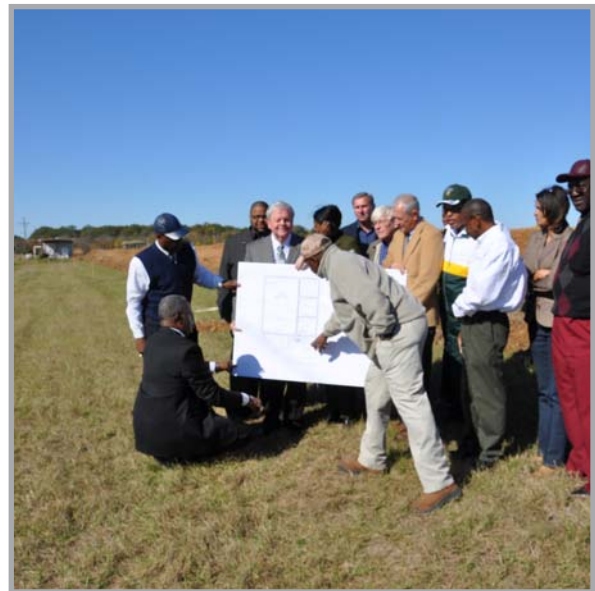
Community leaders in Richland Parish discussing plans for new sewer system improvements. The Town of Rayville received over $6 million for this project.

improve, develop, or finance essential community facilities for rural communities to build facilities, purchase equipment, fund operating costs, fire and rescue stations, public safety, telecommunications for schools, libraries, and health care facilities, etc., up to 100% of market value and 40 years amortization or life of security. These funds cannot be used for recreation activities.