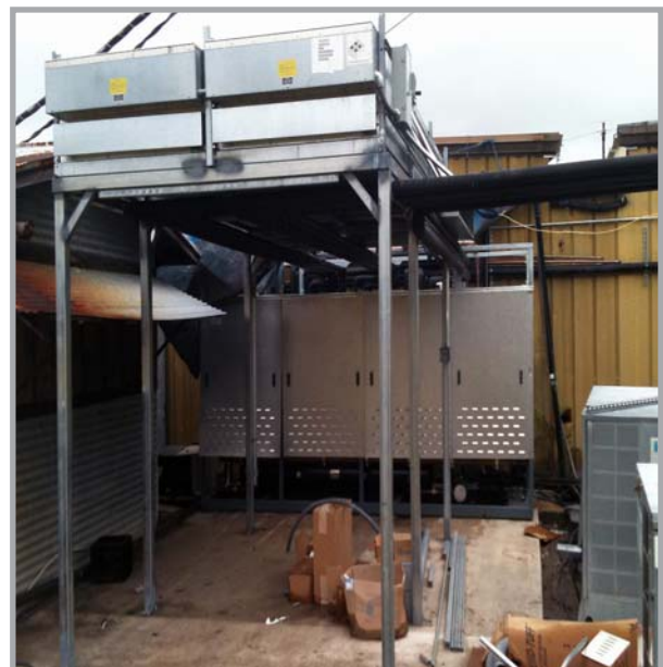
Energy-efficient rack system and refrigeration and freezer units

USDA Rural Development is at the forefront of renewable energy financing, with options including grants, guaranteed loans, and advanced biofuel production payments.