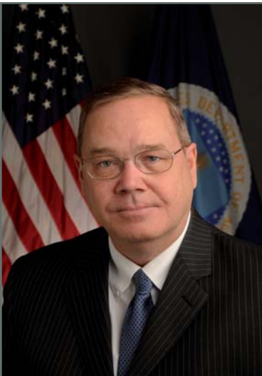
Tom Vilsack Secretary United States Department of Agriculture

“Our Rural Development programs help create and sustain good paying jobs, and will have a lasting impact across the country. In addition to the investments of countless businesses, non-profits, cooperatives, Tribes and local governments that partner with us, much credit is due to our talented, efficient and dedicated workforce of USDA employees who deliver Rural Development assistance in small communities and remote areas across all 50 states of the United States. Their continued commitment to rebuilding and revitalizing rural America is shared by myself, Secretary Vilsack and President Obama.”