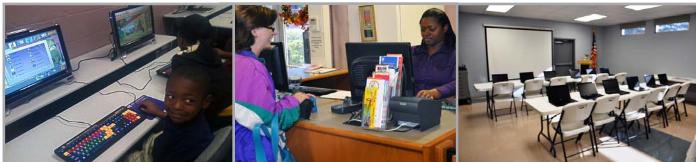
South St. Landry Community Library received a grant for $27,500 to help with needed improvements to enhance computer training and workforce opportunities in Sunset, Louisiana.