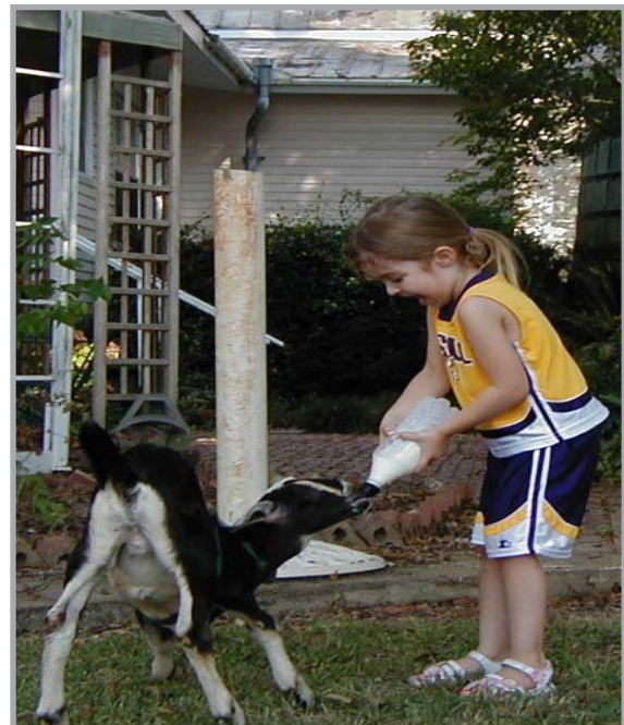
Nubian goat on WesMar Farm in Moreauville

For a list of funding notices, visit http://www.rurdev.usda.gov