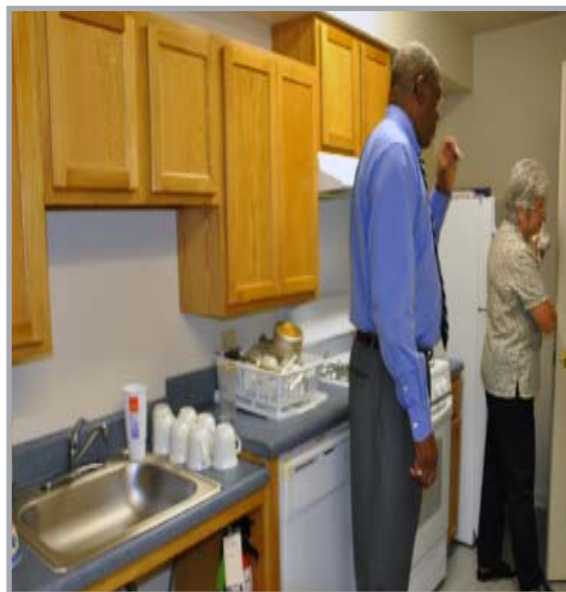
Louisiana State Director and Multi-Family Housing Program Director inspecting unit at newly remodeled Hardwood Apartment Complex in St. Francisville. Rural Development provided $1,381,240 to assist with renovations to this property in West Feliciana Parish.

Loans can be used to build complexes such as apartments, assisted living centers, and multi-family housing in non-metropolitan rural areas of 20,000 or less populations for individuals, trusts, partnerships, developers, profit or non-profit corporations, etc.