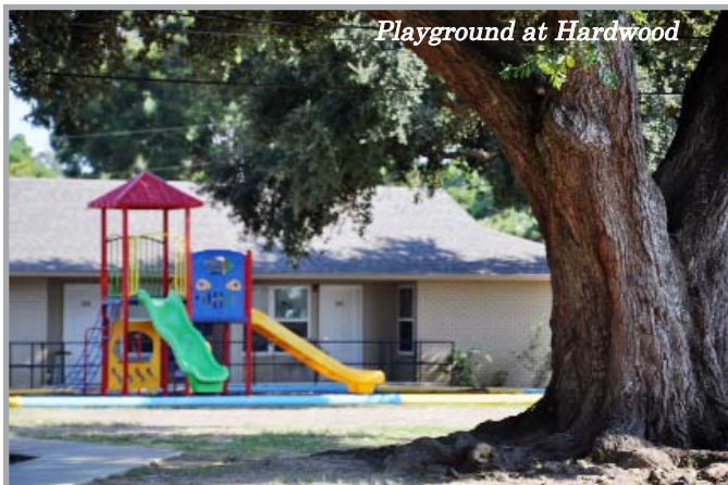
Playground at Hardwood

Each unit has central air, refrigerator, stove, mini-blinds, washer, dryer, and carpet. The apartments are equipped with all necessary hardware for cable, DSL, or wireless Internet access and energy efficient appliances.