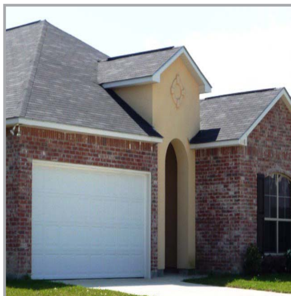
In Denham Springs, the applicant went through a prequalification process until she was eligible to purchase this new home in Livingston Parish for $134,570.

The 502 Direct Loan Program offers 100% financing, no origination fee, and no mortgage insurance requirement for low income people to buy a modest home in which to live and raise a family.