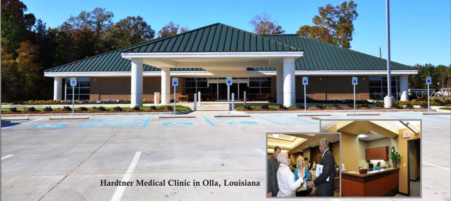
Hardtner Medical Clinic in Olla, Louisiana