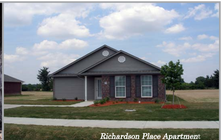
Richardson Place Apartment