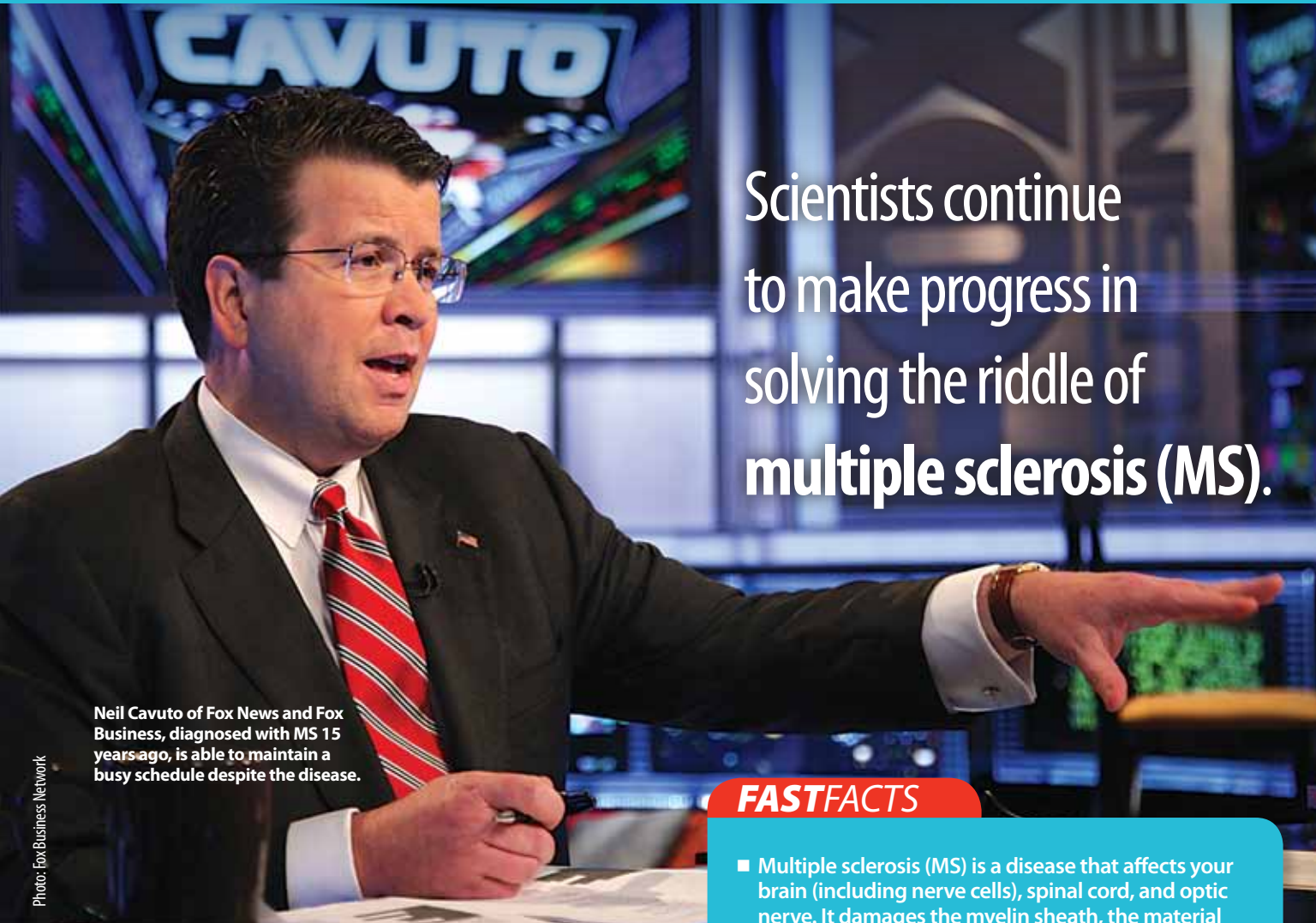
Neil Cavuto of Fox News and Fox Business, diagnosed with MS 15 years ago, is able to maintain a busy schedule despite the disease.