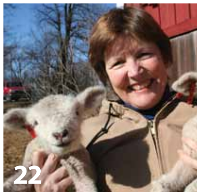
22 Millions of people in the U.S., mostly women, have diseases of the thyroid—the little gland that does so much.

The National Institutes of Health (NIH)—the Nation's Medical Research Agency—includes 27 Institutes and Centers and is a component of the U.S. Department of Health and Human Services. It is the primary federal agency for conducting and supporting basic, clinical, and translational medical research, and it investigates the causes, treatments, and cures for both common and rare diseases. For more information about NIH and its programs, visit www.nih.gov .