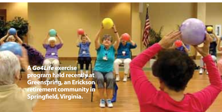
A Go4Life exercise program held recently at Greenspring, an Erickson retirement community in Springfield, Virginia.

" Go4Life can get those of us over 50 moving, exercising, and reducing not only obesity, but a number of chronic diseases," she says. "And we can set an example for those who are younger.