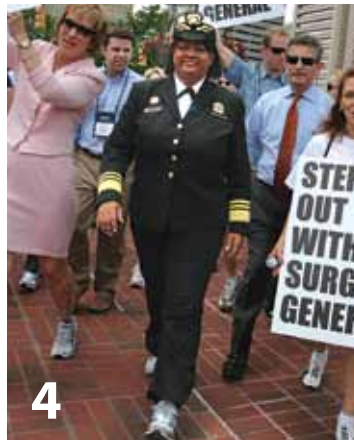
4 Surgeon General Dr. Regina Benjamin urges Americans—including older adults—to “get up and keep moving!”

Articles in this publication are written by professional journalists. All scientific and medical information is reviewed for accuracy by representatives of the National Institutes of Health. However, personal decisions regarding health, finance, exercise, and other matters should be made only after consultation with the reader's physician or professional advisor. Opinions expressed herein are not necessarily those of the National Library of Medicine.