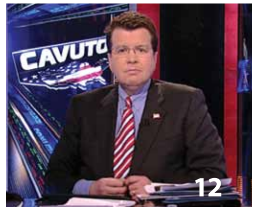
12 Neil Cavuto of Fox News/Fox Business offers encouragement and support to others who also have multiple sclerosis (MS).

4 Go4Life—Fitness for Baby Boomers and Other Older Adults