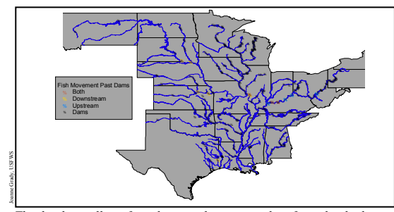
The database allows for release and recapture data for individual paddlefish to be linked. Analysis of these data illustrates the extent to which dams limit paddlefish movements throughout their range.

The Service's Carterville and Columbia Fishery Resources Offices lead the basin-wide coordination and technical assistance for this national project. The Service manages the national database housing biological data for tens of thousands of individually tagged free-ranging paddlefish, and more than 1 million hatchery reared and tagged paddlefish.