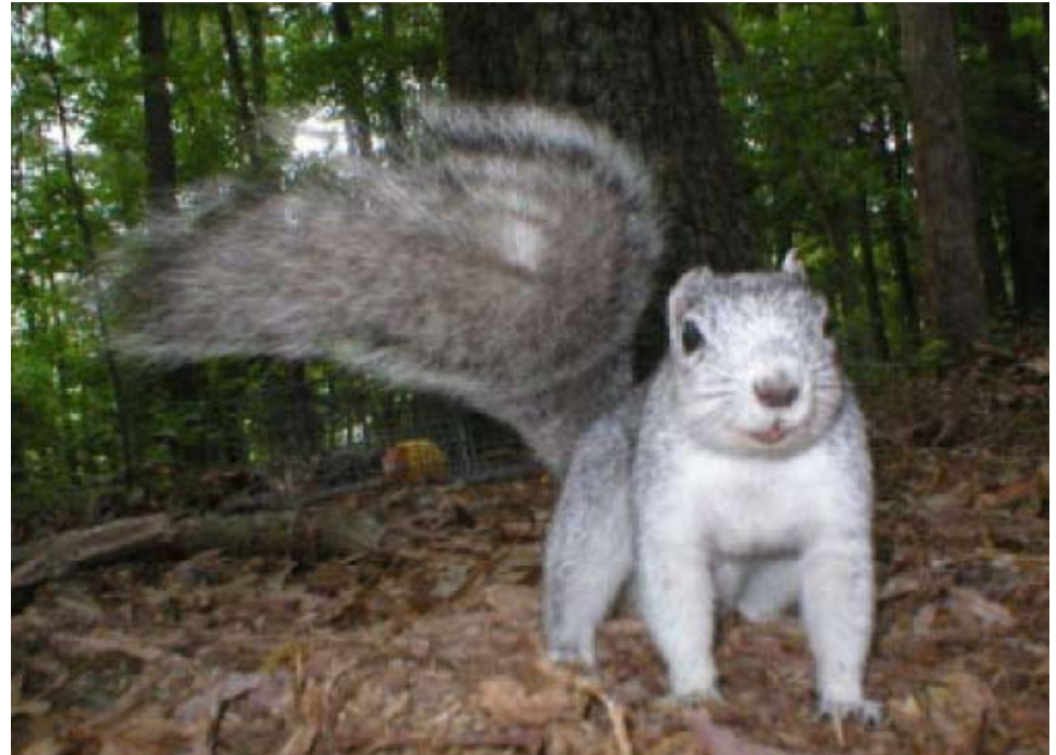
Delmarva Peninsula fox squirrel caught on a motion-triggered camera.

The Delmarva fox squirrel lives in mature forests of mixed hardwoods and pines with a closed canopy and open understory. Although it is a forest animal, the squirrel spends considerable time on the ground foraging for food, typically in woodlots of mixed loblolly pine and hardwoods such as oak, maple, hickory, walnut, and beech—trees that provide food including nuts and seeds. The squirrel will also take food from farm fields. Feeding on tree buds and flowers during the