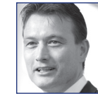
Mr. Halbe Zijlstra State Secretary of Education, Culture and Science