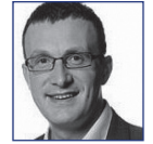
Mr. Pascal Smet Minister, Education, Youth, Equal Opportunities and Brussels Affairs, Flemish Government