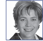
Ms. Henna Virkkunen Minister of Education and Science