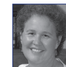
Ms. Linda Darling- Hammond Charles E. Ducommun Professor of Education, Stanford University