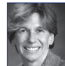
Ms. Randi Weingarten President, The American Federation of Teachers (AFT)