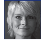
Ms. Tina Nedergaard Minister for Education