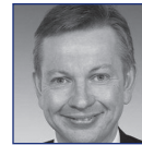
Mr. Michael Gove Secretary of State for Education