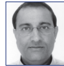
Mr. S Iswaran Senior Minister of State, Ministry of Education