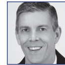
Mr. Arne Duncan U.S. Secretary of Education