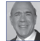
Mr. Angel Gurría Secretary General