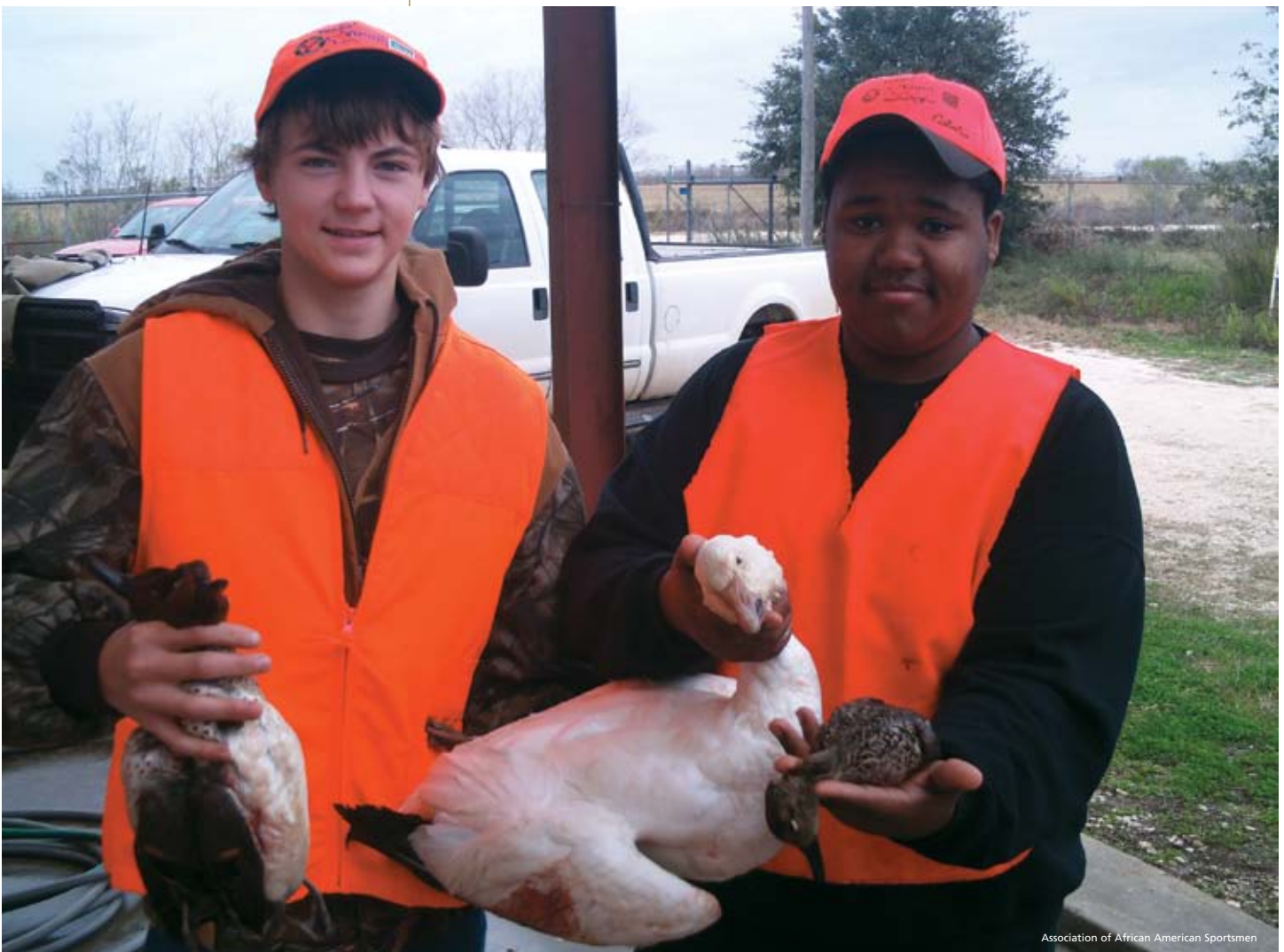
Association of African American Sportsmen

— Vice President Richard Cheney October 3, 2008