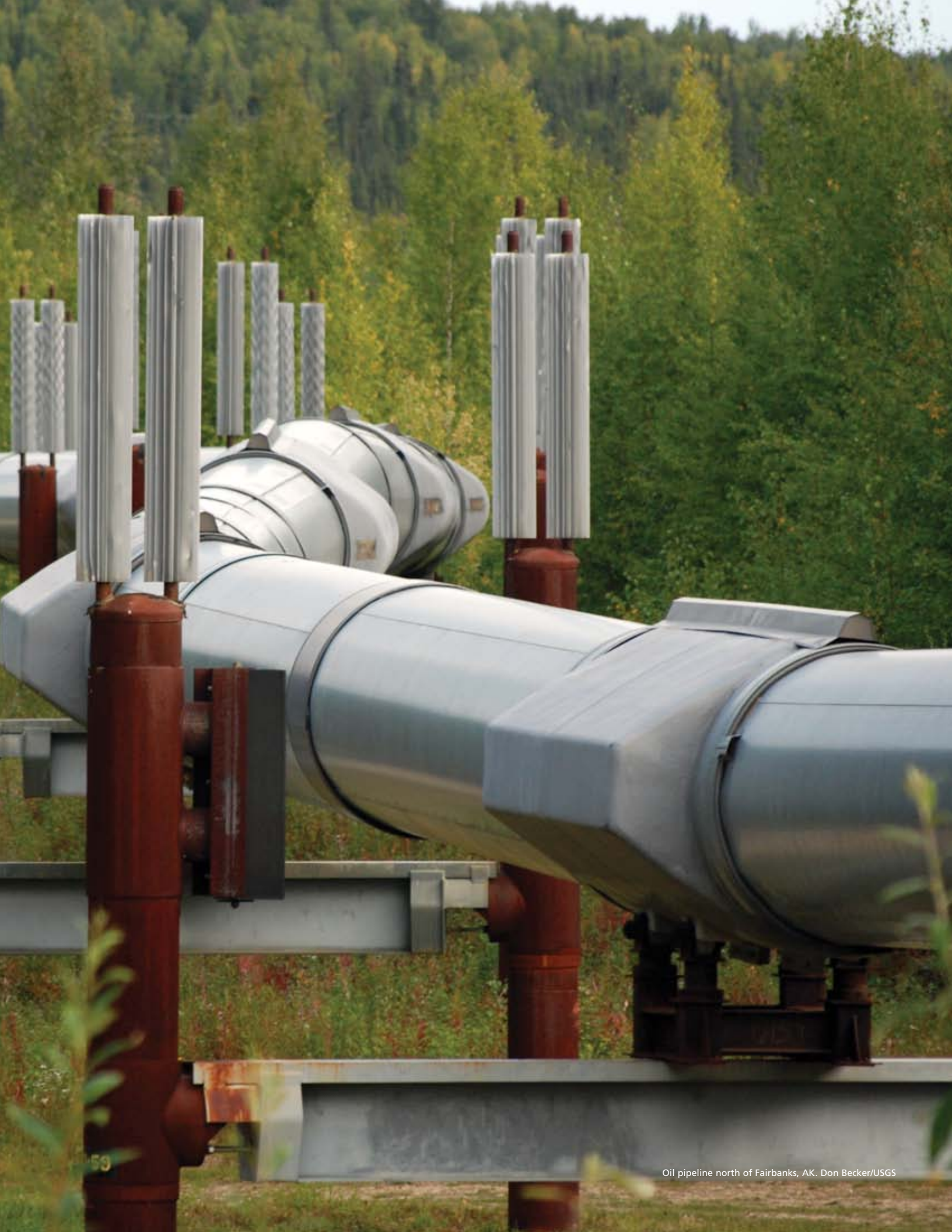
Oil pipeline north of Fairbanks, AK.