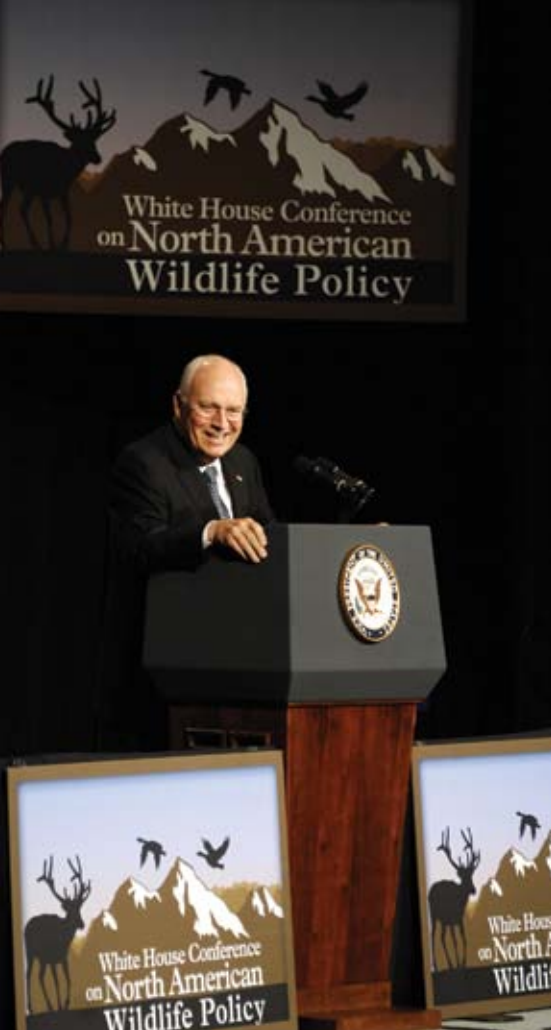
Vice President Richard Cheney addresses the White House Conference.

“The Sporting Conservation Council, which we created in 2006, has proven itself to be an excellent source of insight and good judgment. Congress should formally authorize it for a ten-year term to help us carry out that ten-year plan.”