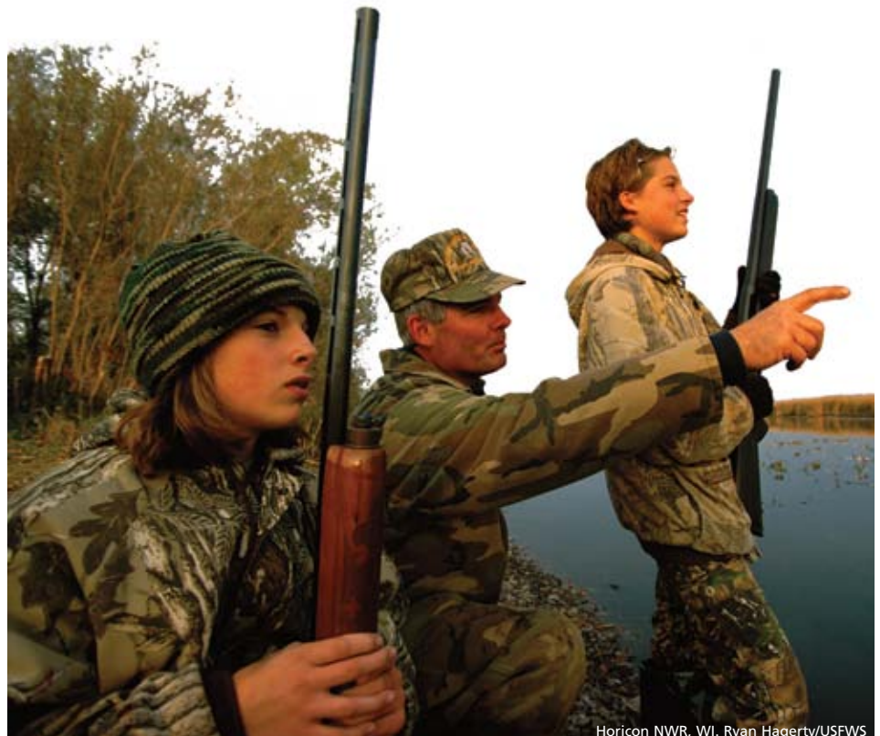
Horicon NWR, WI.