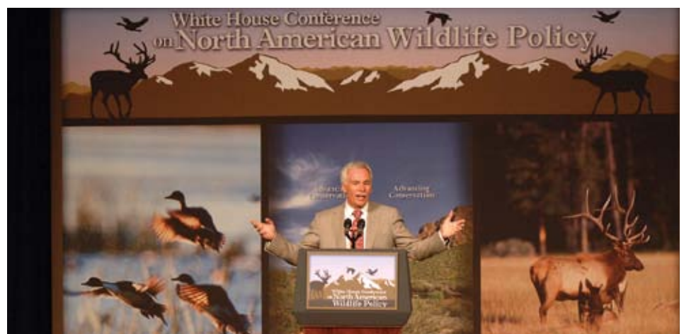
Ed Shafer, Secretary of Agriculture, addresses the conference.