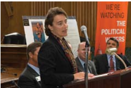
Sen. Blanche Lincoln (D-Arkansas) addresses the Congressional Sportsmen's Caucus briefing on the Action Plan.