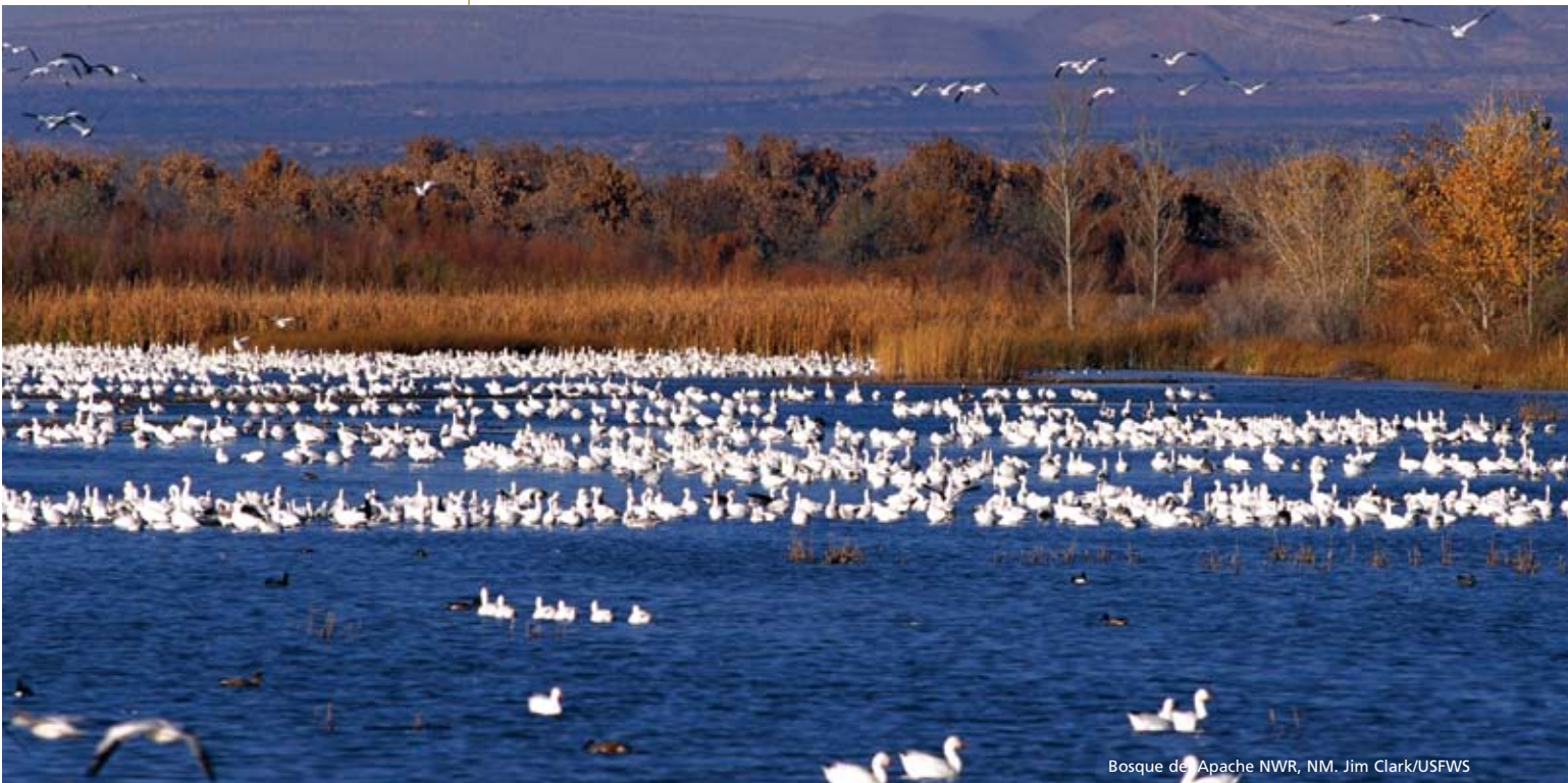
Bosque de Apache NWR, NM.

— Vice President Richard Cheney October 3, 2008