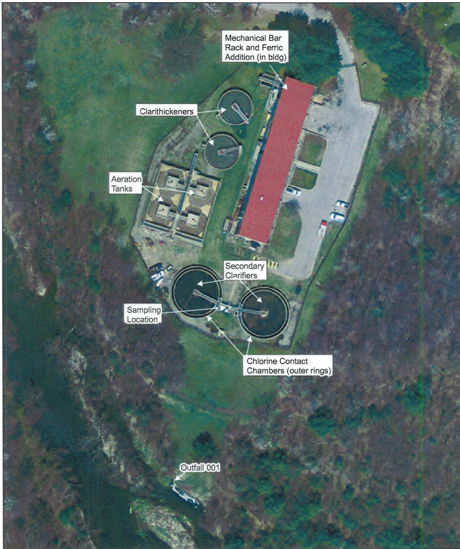
Figure 2. Facility Diagram Grafton WWTP NPDES No. MA0101311