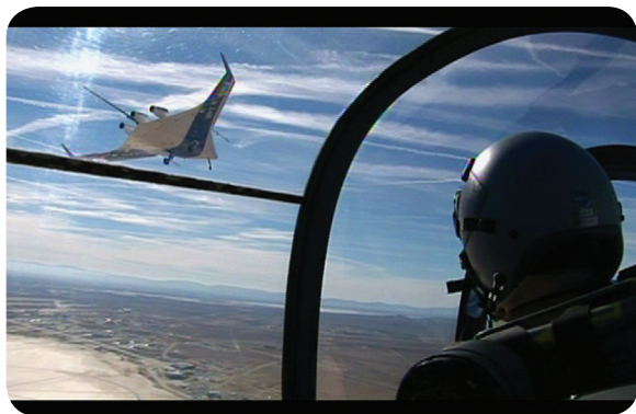
A screen grab from a video shot from the NASA chase plane during a test flight of the blended wing body X-48B.

As demands on the aviation transportation system grow, NASA focuses on discovering ways to improve air traffic, improve aviation safety, reduce fuel consumption, and reduce noise and emissions.