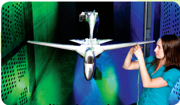
A potential new technology is tested on a subscale aircraft model in a NASA wind tunnel.