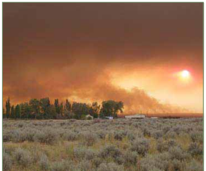
Wildfire impacts natural resources annually in Idaho public lands.