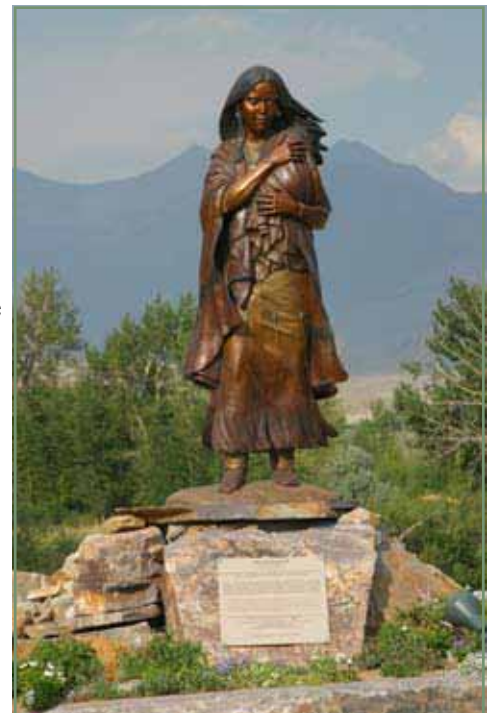
Sacajawea Monument on the Lewis and Clark Trail

A short section of the 3,100 mile primitive backcountry trail traverses east-central Idaho along the Idaho/Montana border. The trail stretches from Canada to Mexico along the backbone of America.