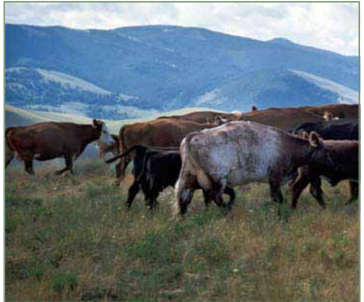
Rangeland provides for recreation, livestock forage, and wildlife habitat.