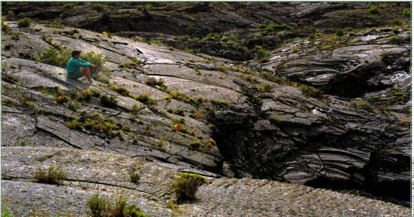
Solitude for now. In the past 15,000 years, eight eruptions have occurred at Craters of the Moon National Monument and Preserve.

Most BLM offices do not sell USGS topographic maps. It's best to call ahead to find out what maps may be obtained at individual BLM offices.