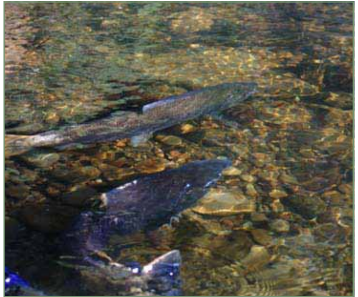
Chinook Salmon come home to spawn each year in Idaho.

We've got trees! Idaho BLM manages over 320,000 acres of commercial forest land producing about 22.3 million board feet of timber and sales generating over $1 million in annual revenues.