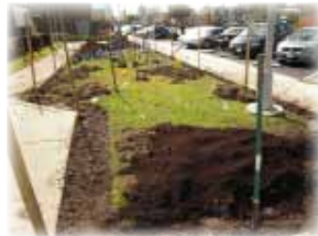
Top Left: Lawndale Library Turf Replacement; Middle and Right: Demonstration Garden, Edward C. Little Water Recycling Facility; Lower Left: High Efficiency Sprinkler.

Many residents do not know how much water they are using and sometimes are unaware of the correct amount to use. West Basin plans to work with its customer agencies to develop programs that provide residents with information and suggestions on water use.