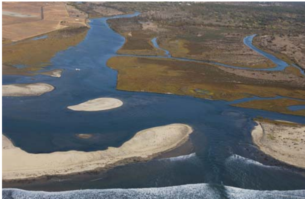
Tijuana River mouth

The following areas are managed by the U.S. Fish and Wildlife Service as part of the National Wildlife Refuge System. A legal description of the boundaries of each National Wildlife Refuge is on file at the San Diego National Wildlife Refuge Complex, 6010 Hidden Valley Road, Carlsbad, CA 92011: