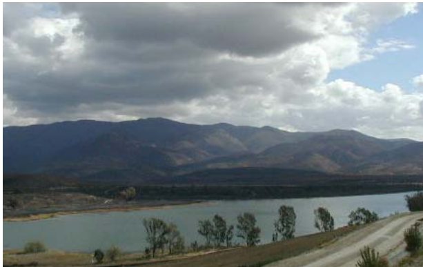
Lower Otay Reservoir

A listing of coastal waters in the San Diego Region and the existing and potential beneficial uses of each are summarized in Table 2-3.