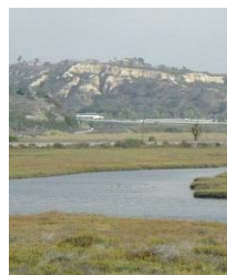
Los Penasquitos Lagoon

Estuarine Habitat (EST) - Includes uses of water that support estuarine ecosystems including, but not limited to, preservation or enhancement of estuarine habitats, vegetation, fish, shellfish, or wildlife (e.g., estuarine mammals, waterfowl, shorebirds).