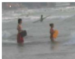
Beachgoers at La Jolla Shores

Hydropower Generation (POW) - Includes uses of water for hydropower generation.