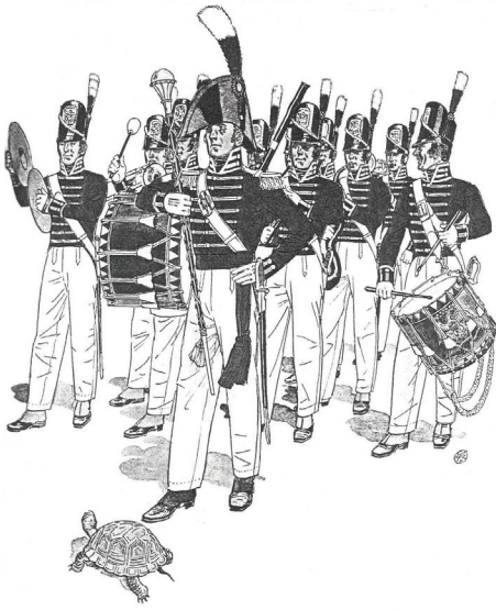
WEST POINT BAND, 1818