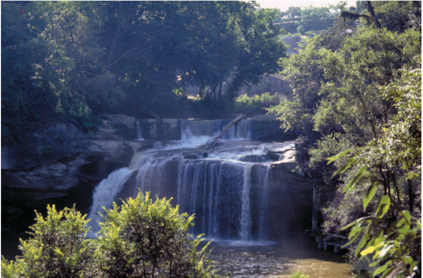
Waterfall in Cascade Park-Where Two Branches of the Black River Join Elyria, Ohio