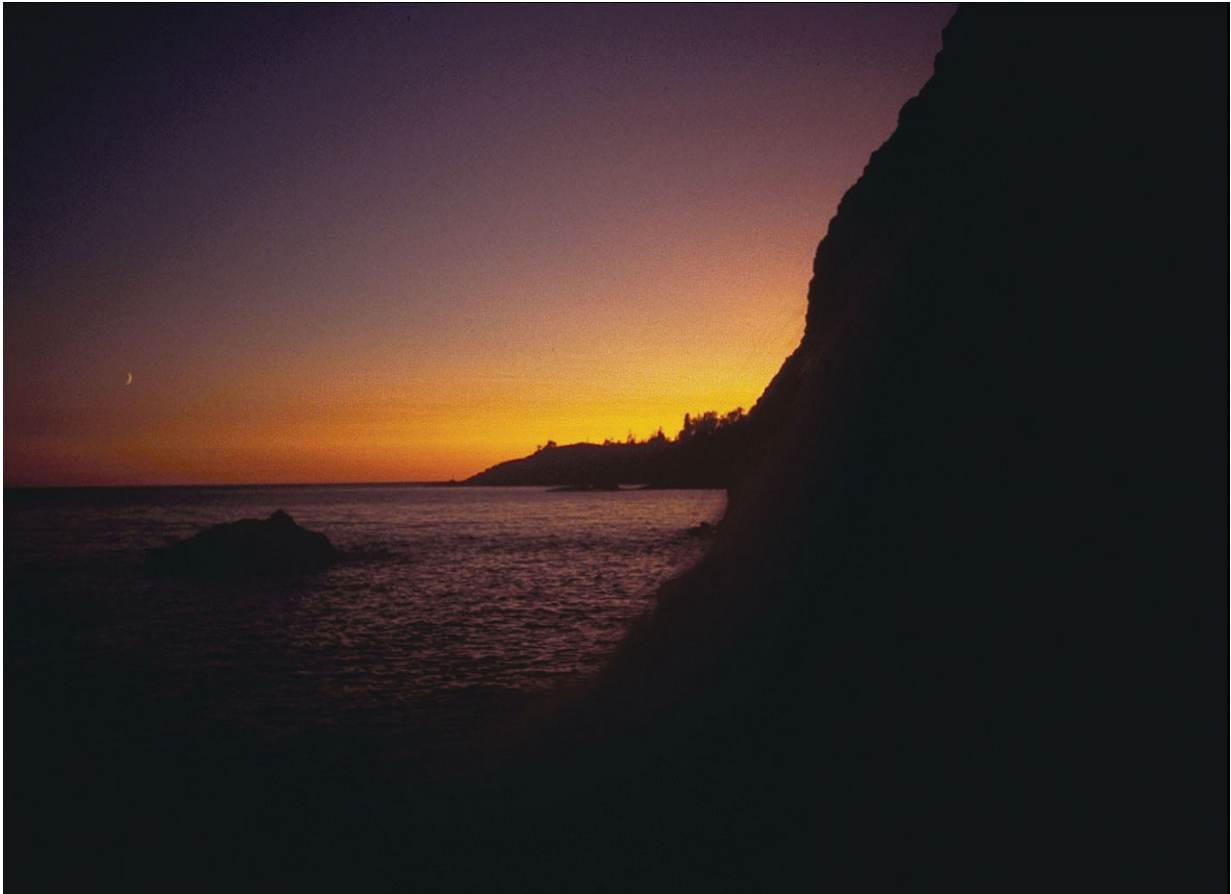
Lakeshore Sunset Lake Superior Dog Harbour, Ontario