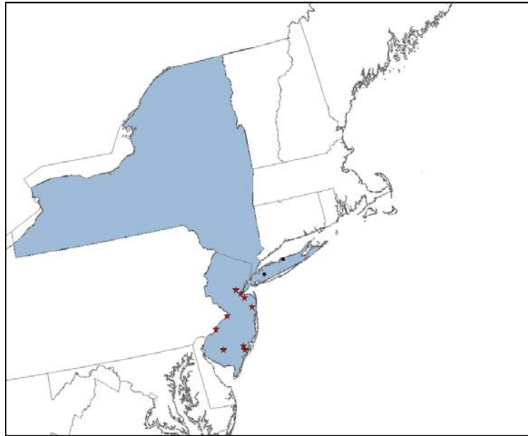
Figure 1: Region 2 Cleanup IAs