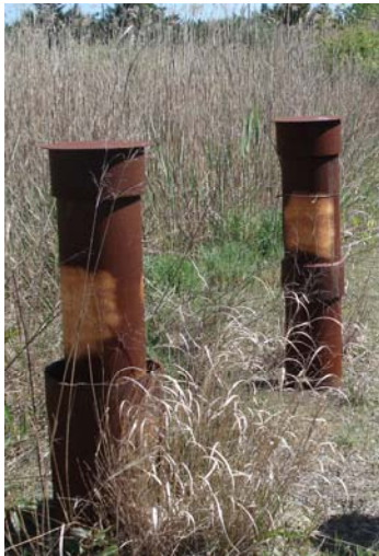
Groundwater sampling wells.

The Superfund program's goal is to clean up uncontrolled hazardous waste sites that pose risks to human health and the environment. The program was authorized under the Comprehensive Environmental Response, Compensation, and Liability Act of 1980 (CERCLA). EPA has several funding vehicles available for Superfund cleanups and must decide which vehicle is best for a site. EPA's choices for funding remediation projects include IAs, contracts, and cooperative agreements. The chief difference among these vehicles is the entity charged with awarding and managing the cleanup construction contract. Site cleanup construction contracts can be awarded and managed by EPA, an EPA contractor, another federal agency (through an IA), or a State (through a cooperative agreement). EPA awarded Recovery Act funds through EPA contracts, cooperative agreements with the States, and IAs with the U.S. Army Corps of Engineers (Corps) and the U.S. Department of the Interior.