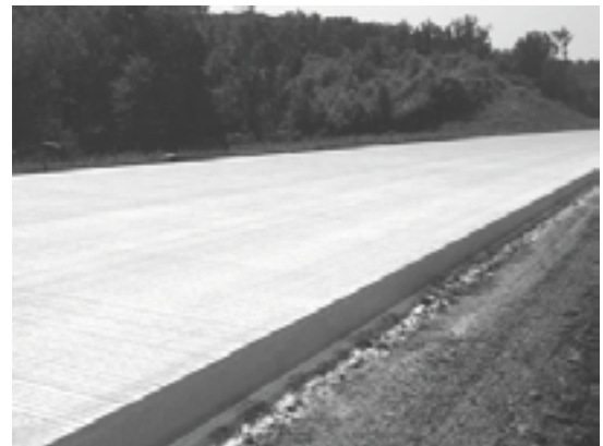
Figure 1. Properly applied curing compound.

Curing has long been recognized as an important process in constructing durable concrete pavements. Curing of concrete is defined as the maintenance of adequate moisture and temperature conditions to allow the development of required physical properties. Curing can consist of both initial and final measures. Initial curing measures include fogging and evaporation retarders where critical drying is likely, and final curing measures typically include white pigmented curing compounds, as shown in Figure 1. Poor curing practices can result in excessive curling, early-age cracking, surface deterioration, low early strengths, and reduced durability. Most of the damage caused by poor curing is irreversible.