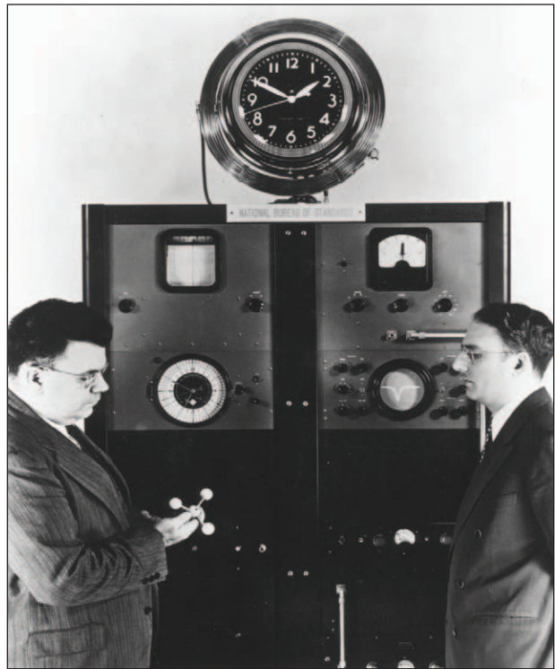
Fig. 2. The first atomic clock based on the ammonia molecule (1949). The inventor, Harold Lyons, is on the right; Edward Condon, then the director of NBS, is on the left.

It seems likely that Isidor Rabi expected cesium ( ^{133}\text{Cs} ) atoms to be used in the first atomic clock [8]. His colleagues at Columbia first measured the cesium resonance frequency in