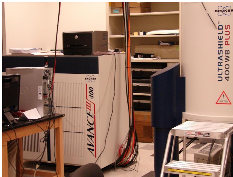
400 MHz NMR