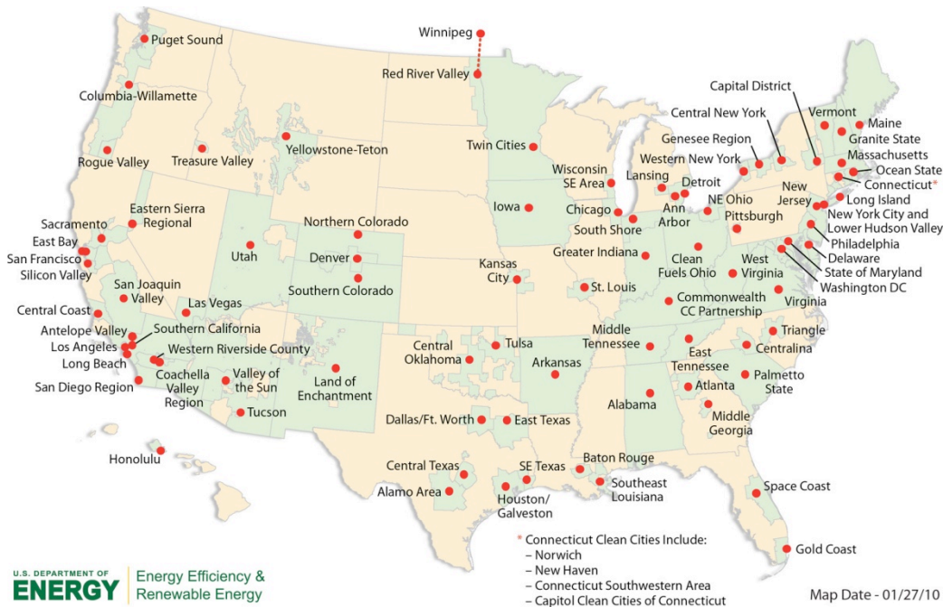
Clean Cities Coalitions

This five-year Clean Cities Strategic Plan is the result of extensive research and participation on the part of Clean Cities program staff, coordinators, and stakeholders; national laboratory technology experts; industry; and partner organizations. The plan is designed to guide decision-making for Clean Cities nationally and through the work of the coalitions in achieving their local objectives. Recognizing that Clean Cities coalitions and their stakeholders increase their effectiveness over time by moving from tactical actions to more strategic decision-making and intentional initiatives, coalition coordinators are encouraged to review this plan to consider how it informs and helps prioritize their work. Industry also can use this plan to envision partnership opportunities that will develop the marketplace further. By design, the plan aims to leverage the strengths, capabilities, and resources of Clean Cities and its coalitions by providing them with support and tools to help them strengthen their effectiveness and maximize their potential to achieve their goals over the next several years.