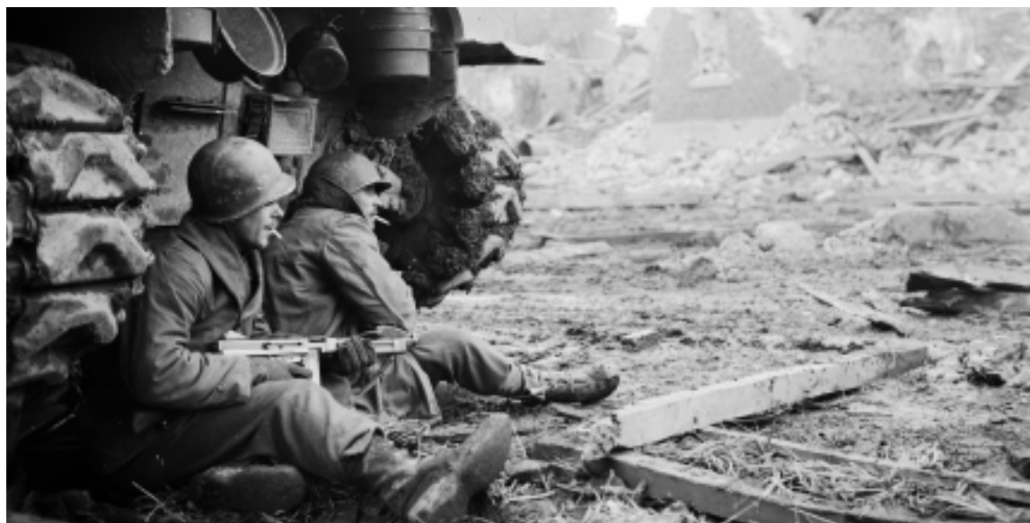
Two soldiers in Geich, Germany. December 11, 1944

This guide — a collaboration between the Library of Congress Veterans History Project, Florentine Films and WETA public television station in Washington, DC — contains hands-on production tips and interview techniques from Ken Burns and Lynn Novick as well as information on how to send completed interviews to the Veterans History Project. This guide was created to help individuals and groups research, conduct and preserve the stories of our nation's veterans and to ensure that they become a part of our country's collective and permanent history.