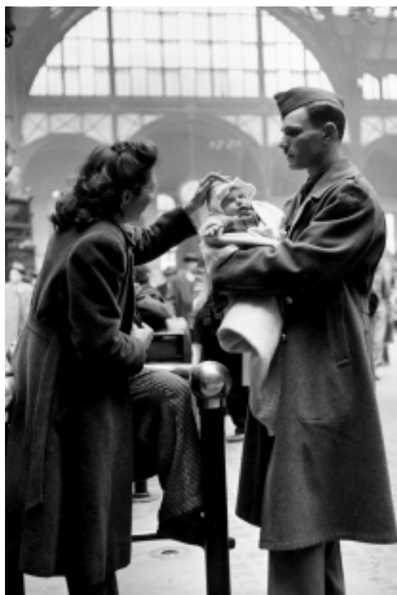
Pennsylvania Station. New York, New York. 1943

Remember, participating PBS stations can also help with equipment and ideas.