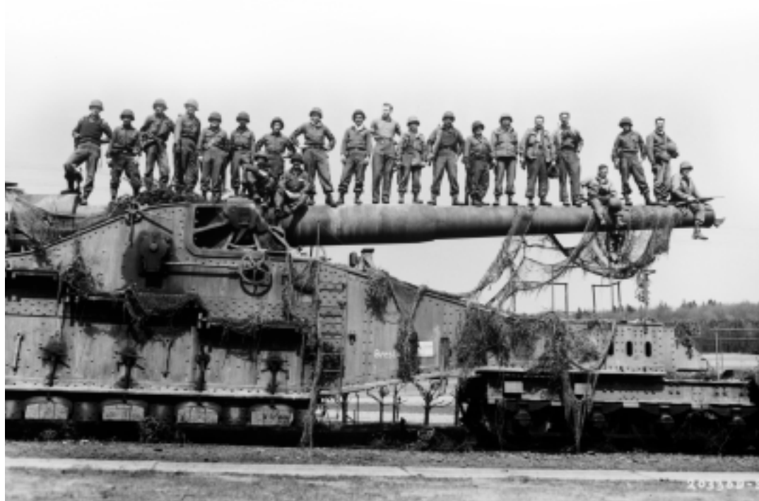
Rentwertshausen, Germany. April 10, 1945

Veterans History Project Library of Congress 101 Independence Avenue, S.E. Washington, DC 20540-4615