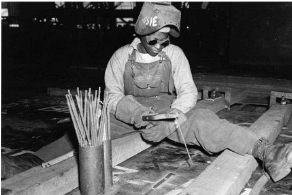
Kaiser shipyards, Richmond, CA. 1943

These forms are extremely important to the process. VHP cannot accept your submission without them.