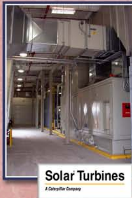
Solar Turbines A Caterpillar Company