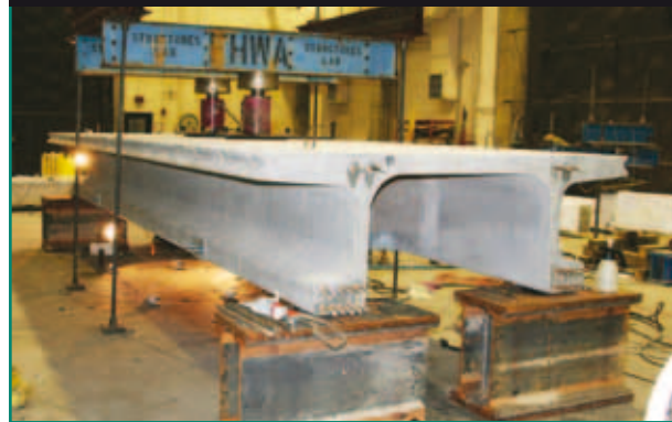
Figure 2. Transverse flexure test.

Design Specifications with a span length up to 87 ft (26.5 m). (5) The transverse flexural capacity of the girder is sufficient, and the capacity of the longitudinal joint exceeded that of the prefabricated deck.